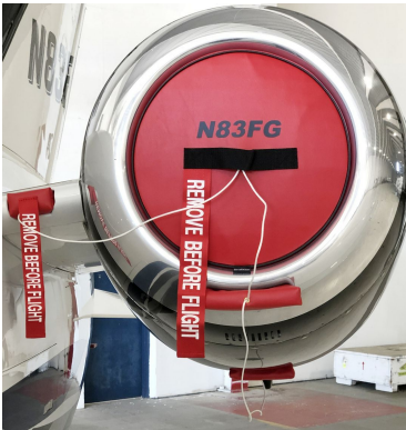
Cessna Citation Mustang 510 Engine Plugs