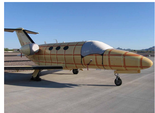
Citation Mustang Cockpit/Door/Nose Cover, Engine Inlet Cover