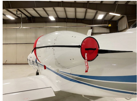
Cessna 510 Engine Inlet Covers &amp; Exhaust Plugs