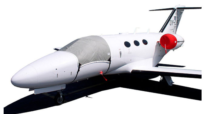
Citation Mustang Windshield Cover, Intake Cover/Exhaust Plug Set, Pitot Covers