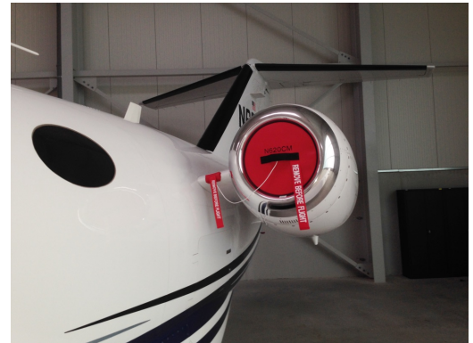
Citation Mustang Engine Intake Plugs