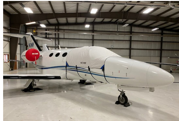
Cessna 510 Cockpit Cover extends to cover door