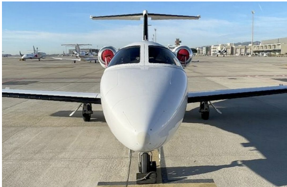
Cessna Mustang Engine Inlet Plugs

The Engine Inlet Plugs are custom fit for your Cessna Mustang 510 intakes, made with heavy-duty vinyl material, and stuffed with a single block of sculpted urethane foam. Each plug has a zipper that allows the foam to be removed and dried if necessary. Engine plugs have 'remove before flight' streamers sewn onto the face of the plugs. Most plugs are imprinted with the aircraft registration number in black for an extra charge. Storage bag NOT included. Engine plugs may be inserted after flight when the engine is still warm. Engine Inlet Plugs are commonly referred to as Cowl Plugs, Intake Plugs, Cowl Blocks, Engine Blocks, and Engine Bungs.