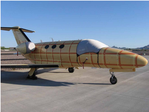
Citation Mustang Light Weight Windshield & Engine Covers