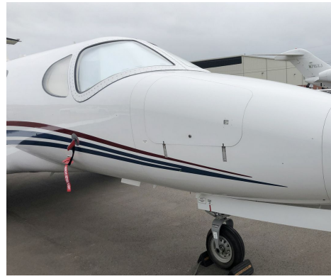
Cessna Mustang 510 Cockpit Heatshields, Pitot Cover/AOA