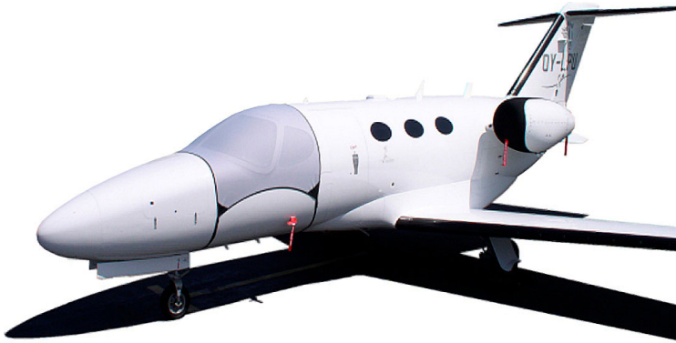
Citation Mustang Light Weight Travel Windshield Cover, "Bikini" type Engine Cover Set

Travel Covers are made with Silver Solution-Dyed Polyester fabric and only lined over the windshield to save weight. The material is lightweight and more compact for easy stowage in the aircraft. The polyester material is water resistant, but only intended for occasional use outside. We also have an ultra lightweight material available for fitted hangar dust covers. For daily outdoor use, the non-travel Sunbrella Cover is the best choice.