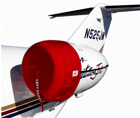
Engine Inlet Cover

The Cessna Mustang 510 Intake/Exhaust Plugs are custom fit for the intake and exhaust openings, made with heavy-duty vinyl material, and stuffed with a single block of sculpted urethane foam. Each plug has a zipper that allows the foam to be removed and dried if necessary. Engine plugs have 'remove before flight' streamers sewn onto the face of the plugs. Most plugs are imprinted with the aircraft registration number in black. Engine plugs may be inserted after flight when the engine is still warm. Engine Inlet Plugs are commonly referred to as Cowl Plugs, Intake Plugs, Cowl Blocks, Engine Blocks, and Engine Bungs.