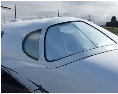
Cessna Mustang 510 Cockpit Heatshields