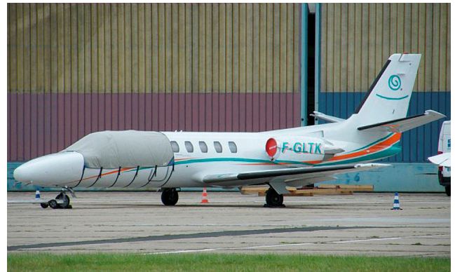
Citation Windshield Cover, to back of door