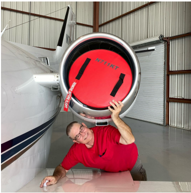
Citation II Engine Plugs

The Engine Inlet Plugs are custom fit for your Cessna Citation II (550, 551, UC-35A, with JT15D) intakes, made with heavy-duty vinyl material, and stuffed with a single block of sculpted urethane foam. Each plug has a zipper that allows the foam to be removed and dried if necessary. Engine plugs have 'remove before flight' streamers sewn onto the face of the plugs. Most plugs are imprinted with the aircraft registration number in black for an extra charge. Storage bag NOT included. Engine plugs may be inserted after flight when the engine is still warm. Engine Inlet Plugs are commonly referred to as Cowl Plugs, Intake Plugs, Cowl Blocks, Engine Blocks, and Engine Bungs.