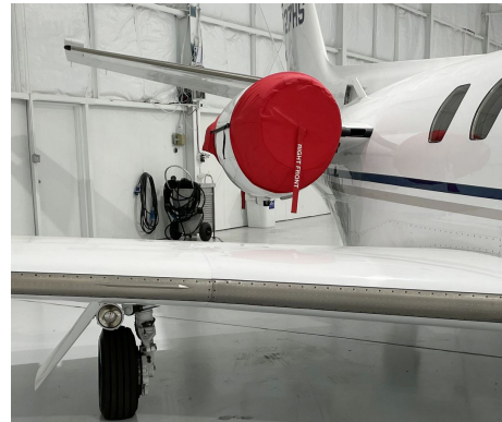
Cessna Citation S550 Intake/Exhaust Covers