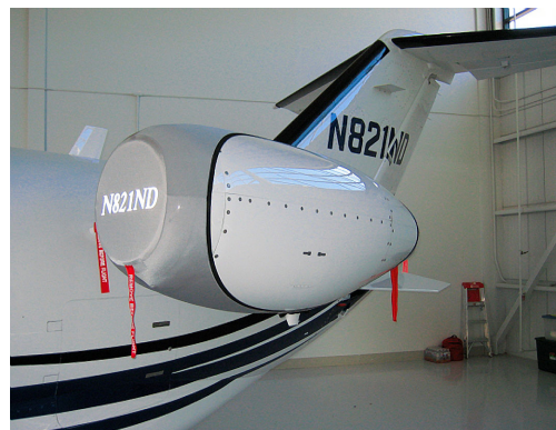
Cessna 551 Citation II SP Engine covers (with thrust reversers, smooth gen. inlet) Cessna 510 Mustang Bikini Type Engine Cover