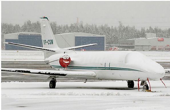
Cessna 560 Engine Inlet/Exhaust Covers, Pitot Cover Set

The Cessna Citation II (550, 551, UC-35A, with JT15D) Intake Covers are designed to install easily yet be completely storable. A spring steel hoop is sewn into the hem of each cover, allowing them to be installed without climbing onto the wing or using a stepladder. To store the covers the spring steel hoop folds like a band-saw blade into three nesting rings. Each cover folds into a compact circular bundle which is stored in the included duffle bag, yet they unfold quickly for use. The Tri-Fold Ring cover is made of medium weight nylon which is available in a variety of colors to match the paint trim. Each cover set comes complete with installation and folding instructions. The aircraft's registration number can be silkscreened onto the cover for an extra charge.