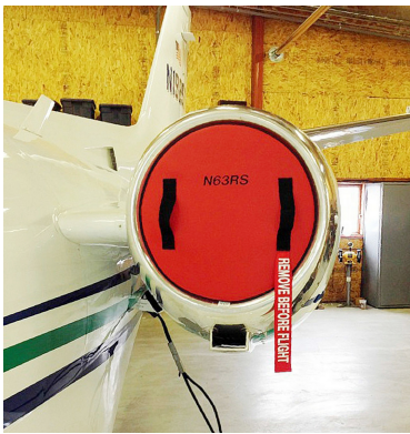
Cessna Citation S2 Intake Plugs

The Engine Inlet Plugs are custom fit for your Cessna Citation II (550, 551, UC-35A, with JT15D) intakes, made with heavy-duty vinyl material, and stuffed with a single block of sculpted urethane foam. Each plug has a zipper that allows the foam to be removed and dried if necessary. Engine plugs have 'remove before flight' streamers sewn onto the face of the plugs. Most plugs are imprinted with the aircraft registration number in black for an extra charge. Storage bag NOT included. Engine plugs may be inserted after flight when the engine is still warm. Engine Inlet Plugs are commonly referred to as Cowl Plugs, Intake Plugs, Cowl Blocks, Engine Blocks, and Engine Bungs.