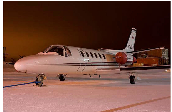
Cessna Citation 550 Engine Cover Set