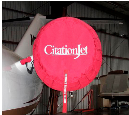
Citation Engine Cover Set

The Cessna Citation II (550, 551, UC-35A, with JT15D) Intake Covers are designed to install easily yet be completely storable. A spring steel hoop is sewn into the hem of each cover, allowing them to be installed without climbing onto the wing or using a stepladder. To store the covers the spring steel hoop folds like a band-saw blade into three nesting rings. Each cover folds into a compact circular bundle which is stored in the included duffle bag, yet they unfold quickly for use. The Tri-Fold Ring cover is made of medium weight nylon which is available in a variety of colors to match the paint trim. Each cover set comes complete with installation and folding instructions. The aircraft's registration number can be silkscreened onto the cover for an extra charge.