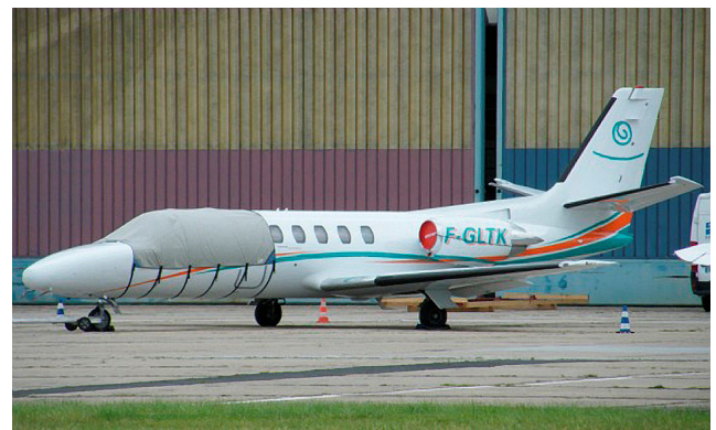
Citation Windshield Cover, to back of door