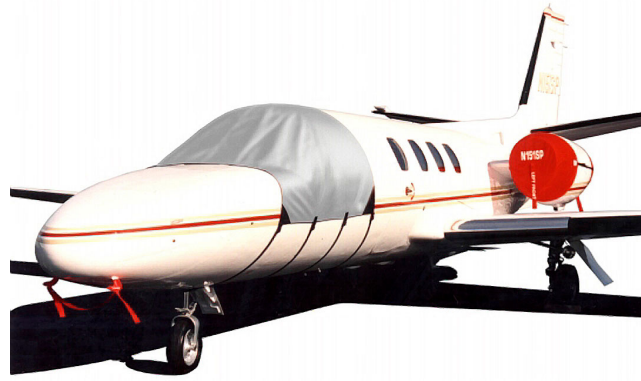
Cessna Citation Windshield Cover, Engine Cover set and Pitot Covers