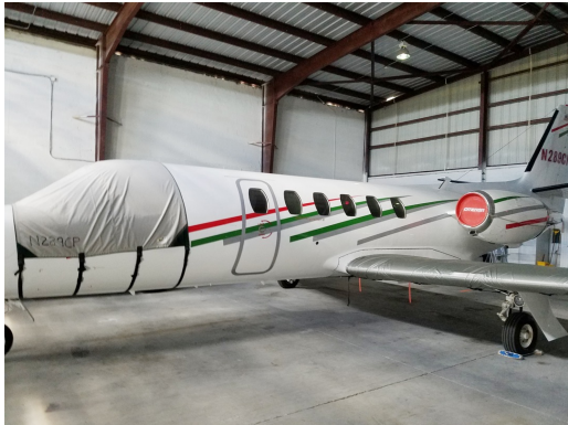
Cessna Citation II Cockpit Cover, Wing Covers

This cover type is made from Silver Acrylic Sunbrella canvas and is 100% lined with a soft and smooth microfiber. Bruce's Custom Covers developed this material combination especially for aircraft protection. The outer material is medium weight and treated for water resistance, UV resistance and anti-static buildup. The inner lining is a very soft and smooth microfiber to prevent scratching. The material is very reflective, and tests show that the cabin interior temperature can be reduced to near-ambient temperature on the hottest of days. It is water, ice and snow repellent, yet breathable to allow moisture to escape from between the cover and the aircraft surface.