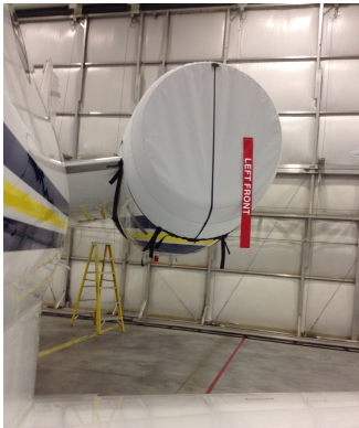
Cessna Citation "Bikini" Type Engine Covers: Extremely Light & Portable Cessna Citation 560XL Upper Nacelle/Brightwork Covers