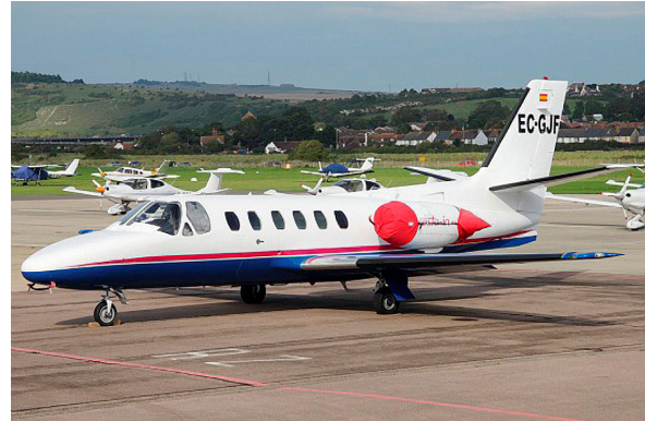
Cessna Citation II Engine Covers, Pitot Covers