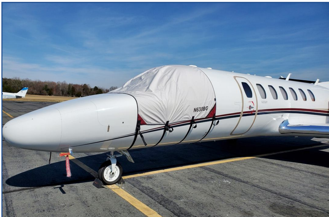
Cessna Citation 560 Cockpit Cover