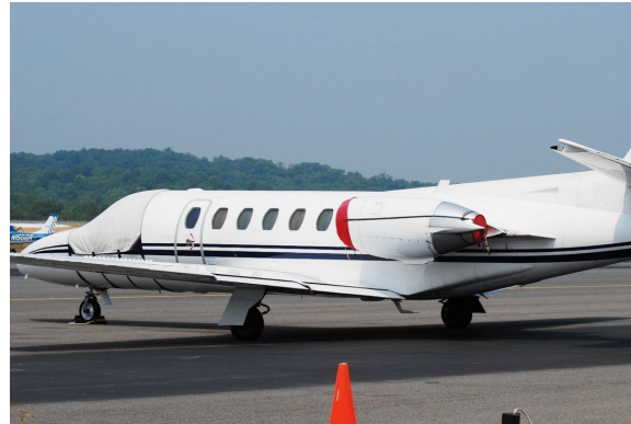
Cessna Citation S2 Cockpit Cover, Intake Covers & Exhaust Plugs