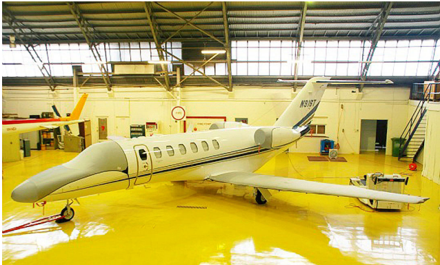
Cessna Citationjet CJ3 Cockpit/Nose, Engine & Wings Travel Covers