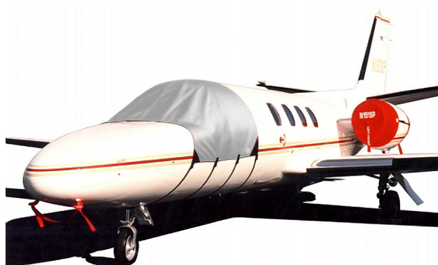
Cessna Citation Windshield Cover, Engine Cover set and Pitot Covers