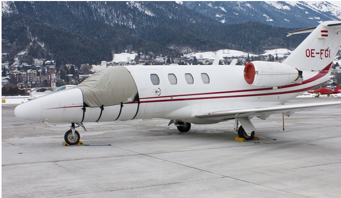
Cessna Citationjet CJ1 Cockpit Cover