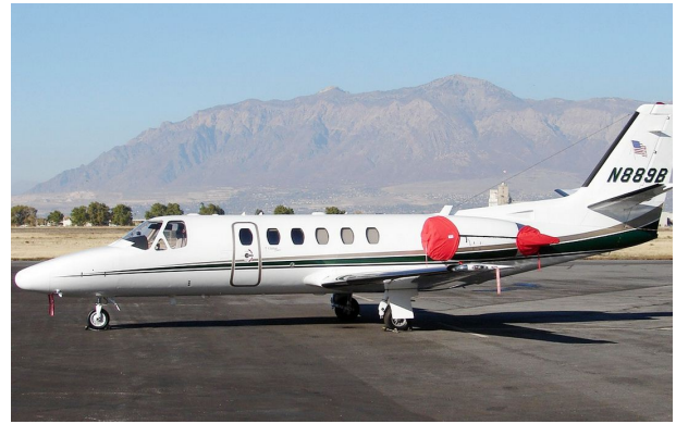
Citation Bravo Tri-Fold Engine Covers