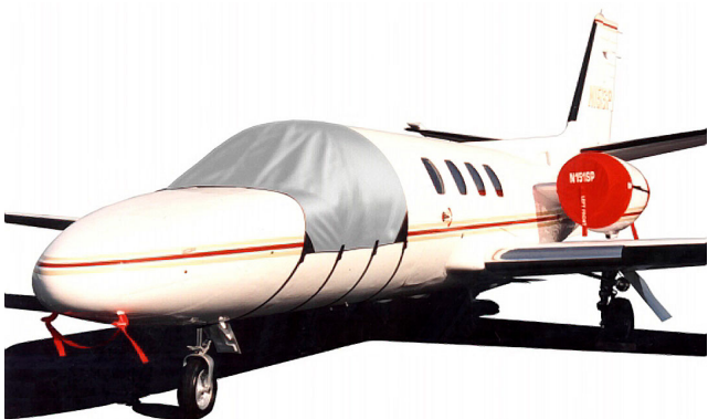
Cessna Citation Windshield Cover, Engine Cover set and Pitot Covers