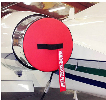
Cessna Citation S2 Exhaust Plugs