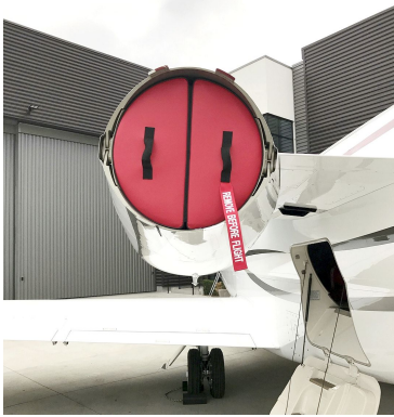
Cessna Citation 680 Exhaust Plugs, folding type

The Cessna Citation II Bravo Intake/Exhaust Plugs are custom fit for the intake and exhaust openings, made with heavy-duty vinyl material, and stuffed with a single block of sculpted urethane foam. Each plug has a zipper that allows the foam to be removed and dried if necessary. Engine plugs have 'remove before flight' streamers sewn onto the face of the plugs. Most plugs are imprinted with the aircraft registration number in black. Engine plugs may be inserted after flight when the engine is still warm. Engine Inlet Plugs are commonly referred to as Cowl Plugs, Intake Plugs, Cowl Blocks, Engine Blocks, and Engine Bungs.