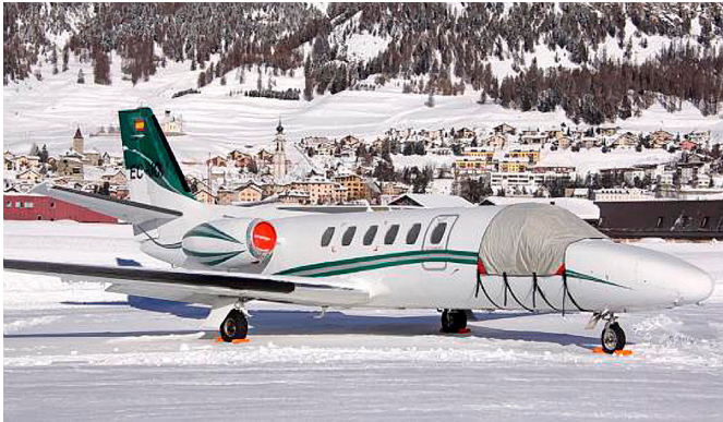
Cessna Citation 550 Windshield Cover

This cover type is made from Silver Acrylic Sunbrella canvas and is 100% lined with a soft and smooth microfiber. Bruce's Custom Covers developed this material combination especially for aircraft protection. The outer material is medium weight and treated for water resistance, UV resistance and anti-static buildup. The inner lining is a very soft and smooth microfiber to prevent scratching. The material is very reflective, and tests show that the cabin interior temperature can be reduced to near-ambient temperature on the hottest of days. It is water, ice and snow repellent, yet breathable to allow moisture to escape from between the cover and the aircraft surface.