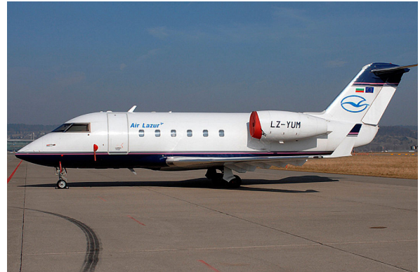
Challenger 600 Intake Covers