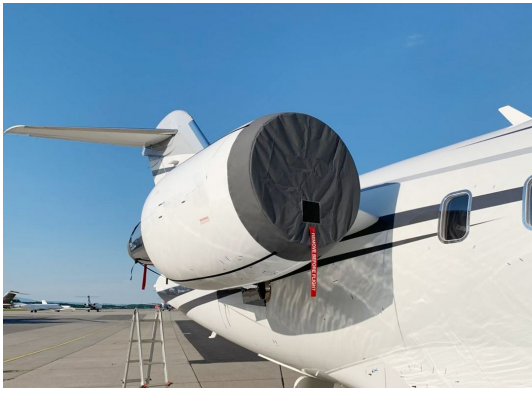
Canadair Challenger 604, 605, 650, 850 Intake/Exhaust Covers (OEM Design)