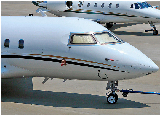
Challenger 604 Cockpit HeatShields