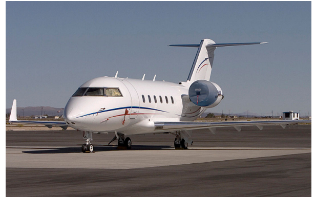
Challenger 604 Intake Covers, standard design