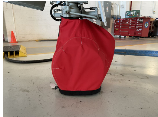
Canadair Challenger 605 Nose Gear Tire Cover