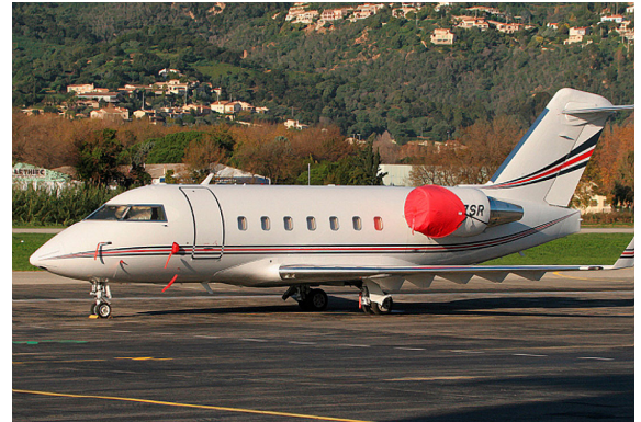
Challenger 601 Intake Covers, standard design