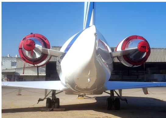
Canadair Challenger 604, 605, 650, 850 Exhaust Plugs

with the aircraft registration number in black for an extra charge. Storage bag NOT included. Engine plugs may be inserted after flight when the engine is still warm. Engine Inlet Plugs are commonly referred to as Cowl Plugs, Intake Plugs, Cowl Blocks, Engine Blocks, and Engine Bungs.