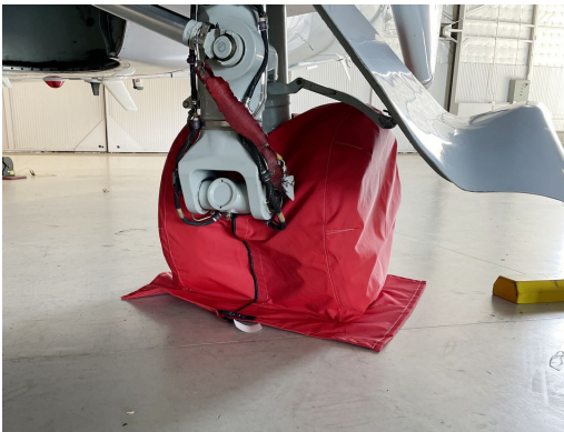
Canadair Challenger 605 Main Gear Tire Covers

ALL-YEAR USE MATERIAL - Made with Silver Acrylic Sunbrella canvas, the all-year use material is the best option for sun protection and cover longevity. This heavier more durable material is intended for all weather conditions, such as rain and snow or lots of sun.