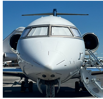
Bombardier CL-600-2B16 Cockpit Heatshields