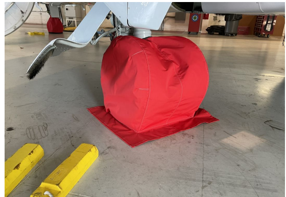
Canadair Challenger 605 Main Gear Tire Covers