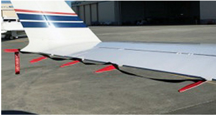
Static Wick Covers

with the aircraft registration number in black for an extra charge. Storage bag NOT included. Engine plugs may be inserted after flight when the engine is still warm. Engine Inlet Plugs are commonly referred to as Cowl Plugs, Intake Plugs, Cowl Blocks, Engine Blocks, and Engine Bungs.