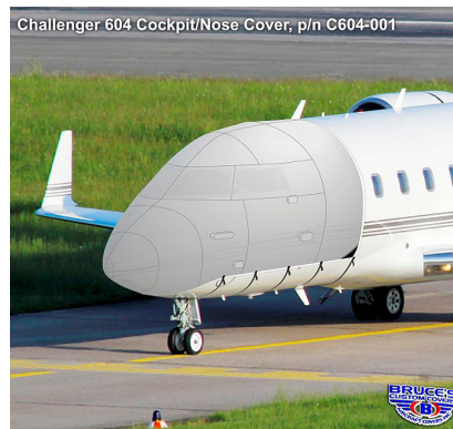
Challenger 601/604 Cockpit/Nose Cover, illustration

This cover type is made from Silver Acrylic Sunbrella canvas and is 100% lined with a soft and smooth microfiber. Bruce's Custom Covers developed this material combination especially for aircraft protection. The outer material is medium weight and treated for water resistance, UV resistance and anti-static buildup. The inner lining is a very soft and smooth microfiber to prevent scratching. The material is very reflective, and tests show that the cabin interior temperature can be reduced to near-ambient temperature on the hottest of days. It is water, ice and snow repellent, yet breathable to allow moisture to escape from between the cover and the aircraft surface.