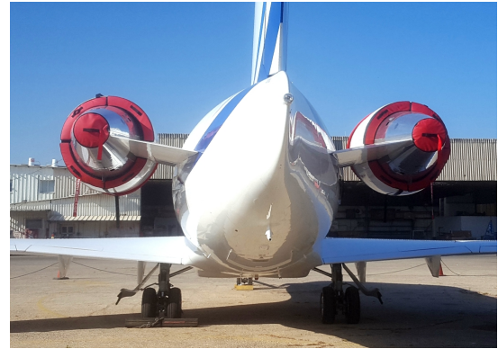
Canadair Challenger 604, 605, 650, 850 Exhaust Plugs