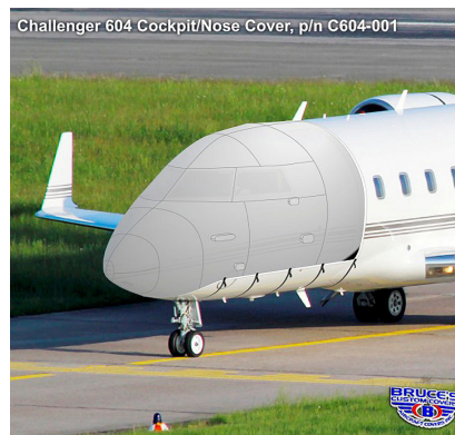
Challenger 601/604 Cockpit/Nose Cover, illustration

This cover type is made from Silver Acrylic Sunbrella canvas and is 100% lined with a soft and smooth microfiber. Bruce's Custom Covers developed this material combination especially for aircraft protection. The outer material is medium weight and treated for water resistance, UV resistance and anti-static buildup. The inner lining is a very soft and smooth microfiber to prevent scratching. The material is very reflective, and tests show that the cabin interior temperature can be reduced to near-ambient temperature on the hottest of days. It is water, ice and snow repellent, yet breathable to allow moisture to escape from between the cover and the aircraft surface.