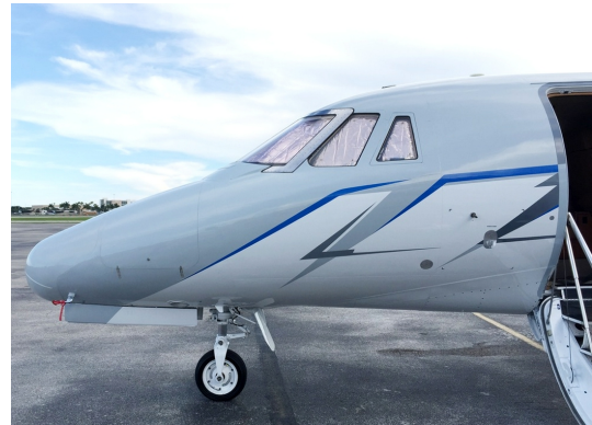
Cessna Citation 650 Cockpit HeataShields