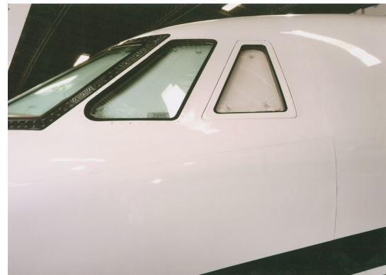
Citation XL Cockpit HeatShields