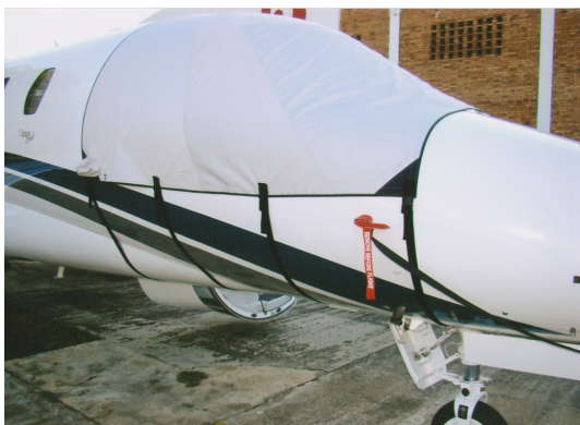
Citation XL Cockpit Cover

This cover type is made from Silver Acrylic Sunbrella canvas and is 100% lined with a soft and smooth microfiber. Bruce's Custom Covers developed this material combination especially for aircraft protection. The outer material is medium weight and treated for water resistance, UV resistance and anti-static buildup. The inner lining is a very soft and smooth microfiber to prevent scratching. The material is very reflective, and tests show that the cabin interior temperature can be reduced to near-ambient temperature on the hottest of days. It is water, ice and snow repellent, yet breathable to allow moisture to escape from between the cover and the aircraft surface.