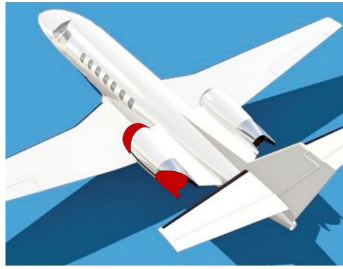
Cessna Citation II with TR's Exhaust Cover Illustration