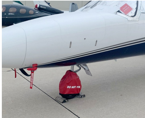
Cessna Citation Nose Tire Cover

ALL-YEAR USE MATERIAL - Made with Silver Acrylic Sunbrella canvas, the all-year use material is the best option for sun protection and cover longevity. This heavier more durable material is intended for all weather conditions, such as rain and snow or lots of sun.