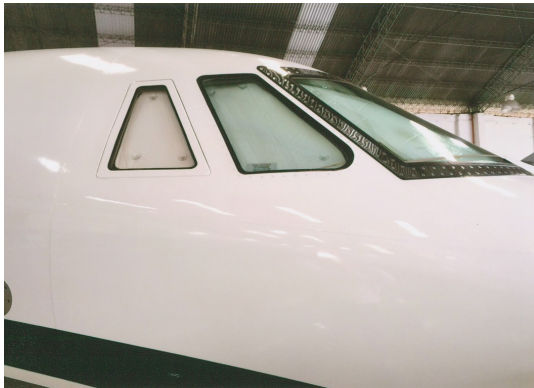
Citation XL Cockpit HeatShields

Cockpit Heatshields are interior sunshades for the aircraft's cockpit. The product is a unique composite of closed-cell foam with a silver mylar finish. The semi-rigid design is stiff enough to stand inside the window framing. The set folds up flat and is easily stored in the included storage sleeve. Some designs may require velcro and suction cups. Our Heatshields for jets are offered white side out because some aircraft manufacturers have issued advisories against reflective window inserts due to potential heat damage. A Heatshield is an excellent short-term remedy for cockpit overheating, but an external fabric cover is more effective for long-term protection.