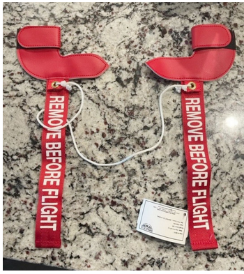
Cessna Citation Pitot Cover Set