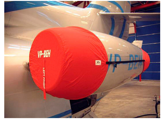
Falcon 900 Sovereign Engine Covers