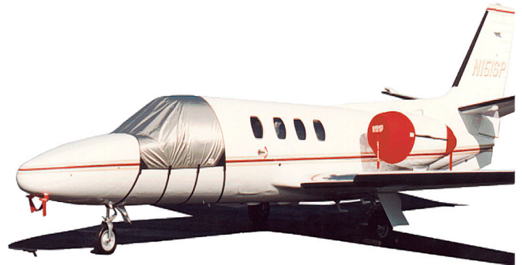
Cessna Citation I Windshield, Pitot and Engine Covers