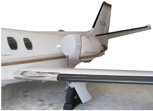
Cessna Citation "Bikini" Type Engine Covers: Extremely Light & Portable