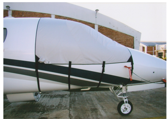
Citation XL Cockpit Cover