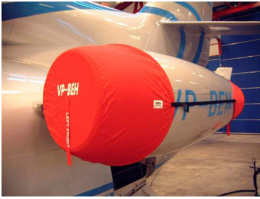
Falcon 900 Sovereign Engine Covers