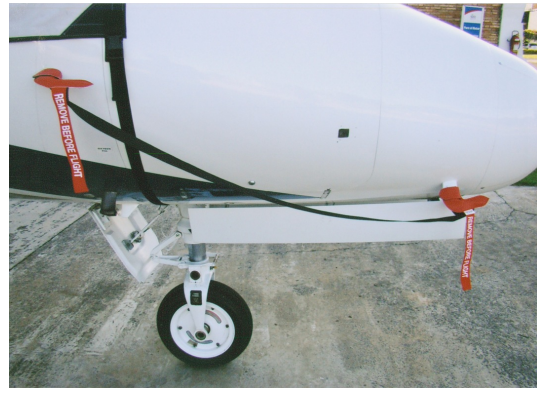
Citation XL Pitot Covers