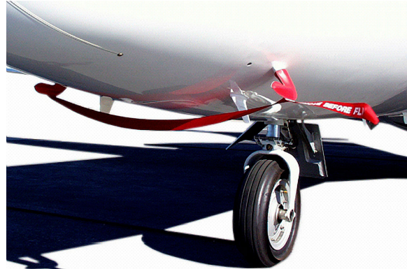
Cessna Citation I Pitot Covers