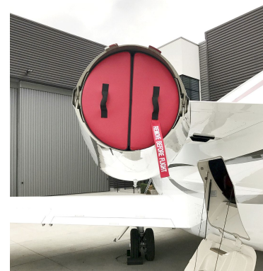
Cessna Citation 680 Exhaust Plugs, folding type