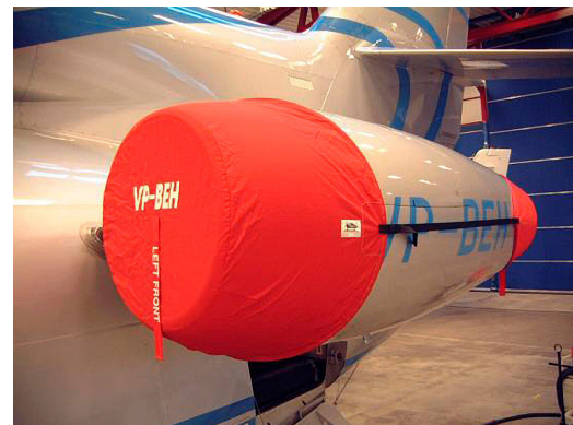
Falcon 900 Sovereign Engine Covers