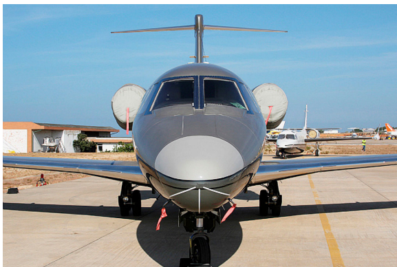
Citation III 650 Engine Covers Set

The Cessna Citation Latitude (680A) Intake/Exhaust Plugs are custom fit for the intake and exhaust openings, made with heavy-duty vinyl material, and stuffed with a single block of sculpted urethane foam. Each plug has a zipper that allows the foam to be removed and dried if necessary. Engine plugs have 'remove before flight' streamers sewn onto the face of the plugs. Most plugs are imprinted with the aircraft registration number in black. Engine plugs may be inserted after flight when the engine is still warm. Engine Inlet Plugs are commonly referred to as Cowl Plugs, Intake Plugs, Cowl Blocks, Engine Blocks, and Engine Bungs.