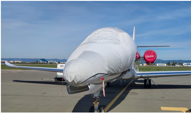
Cessna Citation Latitude (680A) Cockpit/Nose Cover, Doesn't Cover Pitot Tubes