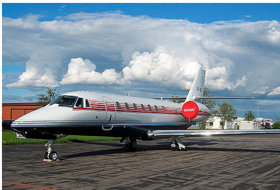
Citation Sovereign Engine Covers

The Cessna Citation Latitude (680A) Intake/Exhaust Plugs are custom fit for the intake and exhaust openings, made with heavy-duty vinyl material, and stuffed with a single block of sculpted urethane foam. Each plug has a zipper that allows the foam to be removed and dried if necessary. Engine plugs have 'remove before flight' streamers sewn onto the face of the plugs. Most plugs are imprinted with the aircraft registration number in black. Engine plugs may be inserted after flight when the engine is still warm. Engine Inlet Plugs are commonly referred to as Cowl Plugs, Intake Plugs, Cowl Blocks, Engine Blocks, and Engine Bungs.