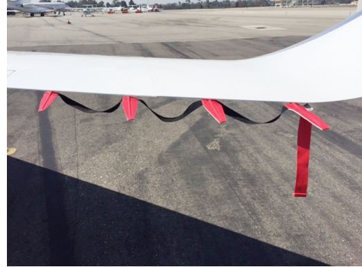
Citation X Static Wick Protectors