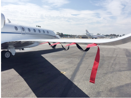
Citation X Static Wick Protectors

ALL-YEAR USE MATERIAL - Made with Silver Acrylic Sunbrella canvas, the all-year use material is the best option for sun protection and cover longevity. This heavier more durable material is intended for all weather conditions, such as rain and snow or lots of sun.