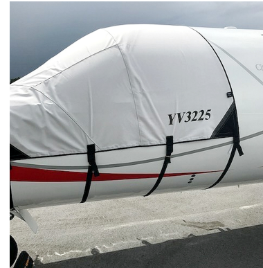
Cessna Citationjet V Ultra (560) Cockpit Cover