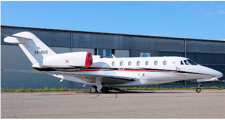
Citation X Intake & Pitot Tube Covers