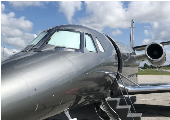
Cessna Citation 560XL Cockpit HeatShields

Cockpit Heatshields are interior sunshades for the aircraft's cockpit. The product is a unique composite of closed-cell foam with a silver mylar finish. The semi-rigid design is stiff enough to stand inside the window framing. The set folds up flat and is easily stored in the included storage sleeve. Some designs may require velcro and suction cups. Our Heatshields for jets are offered white side out because some aircraft manufacturers have issued advisories against reflective window inserts due to potential heat damage. A Heatshield is an excellent short-term remedy for cockpit overheating, but an external fabric cover is more effective for long-term protection.