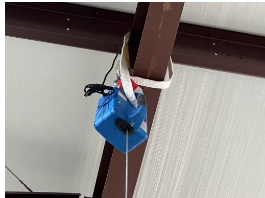
Stearman PT-13 Full Body Dust Cover, Remote Control Winch