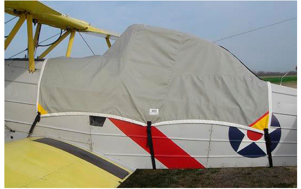
Grumman Ag Cat Canopy Cover