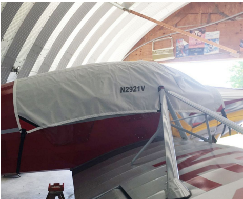
Callair A-2 Canopy Cover