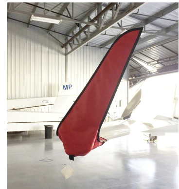
Schleicher ASH Wingtip Pads