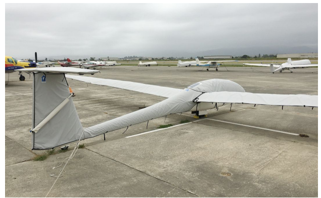
DG-505 Canopy/Nose, Wing, Empennage & Horiz. Stab. Covers