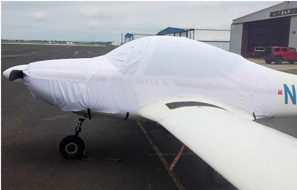
Taifun 17E Canopy/Engine Cover, test fit cover