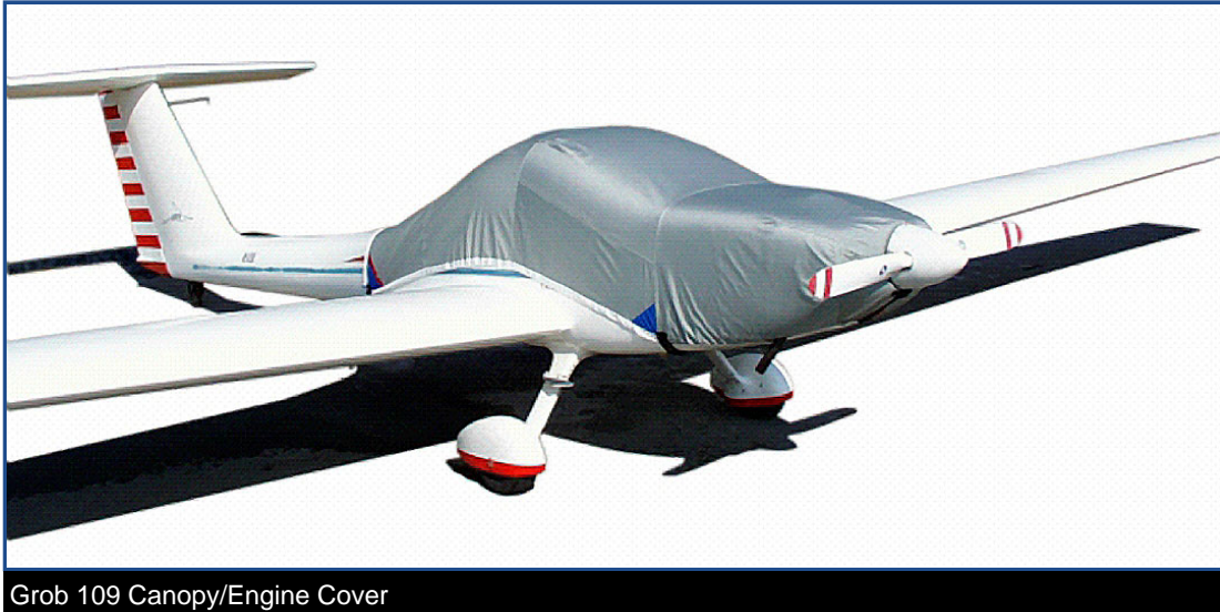
Grob 109 Canopy/Engine Cover