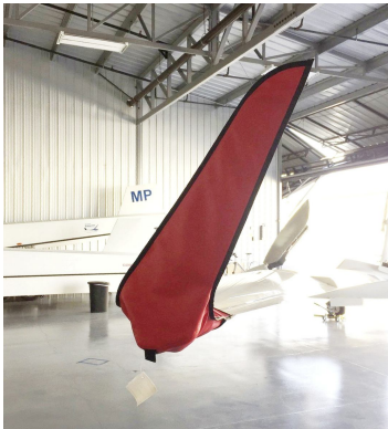
Schleicher ASH Wingtip Pads

Designed to prevent damage to the wingtip in crowded hangars or high traffic areas, these products are made of bright red Naugahyde and thickly padded with a sandwich of closed cell foam. Protects delicate winglets, casters and their housings, and soft finishes.