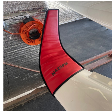
Stemme S-10 & S-12 Wingtip Pads