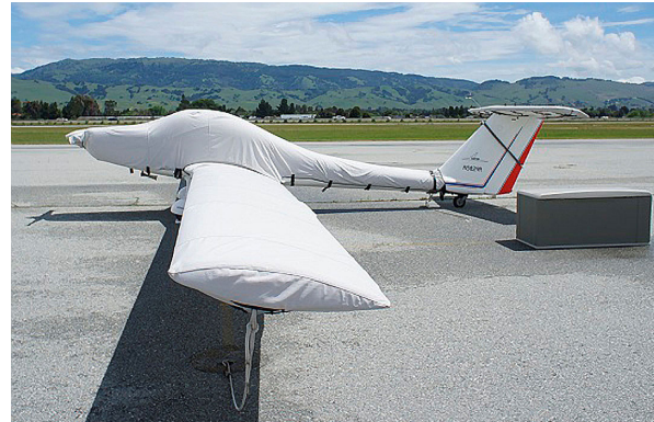
Grob 109 Canopy/Engine w/ extension to tail, Wing, Stabilizer & Prop/Spinner Covers