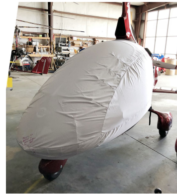
Cavalon Gyrocopter Bubble Cover, test fit cover