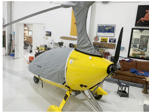
Autogyro Calidus Gyrocopter Canopy/Nose & Rotor Hub/Mast Cover