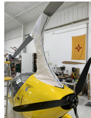
Calidus Gyrocopter Rotor Mast Cover, test fit cover