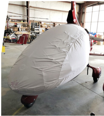
Cavalon Gyrocopter Bubble Cover, test fit cover

Travel Covers are made with Silver Solution-Dyed Polyester fabric and fully lined over the entire cover. The material is lightweight and more compact for easy storage in the aircraft. The polyester material is water resistant, but only intended for occasional use outside. We also have an ultra lightweight material available for fitted hangar dust covers. For daily outdoor use, the non-travel Sunbrella Cover is the best choice.