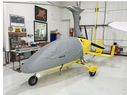
Calidus Gyrocopter Rotor Mast Cover, test fit cover