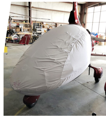
Autogyro Calidus Gyrocopter Canopy/Nose & Rotor Hub/Mast Cover