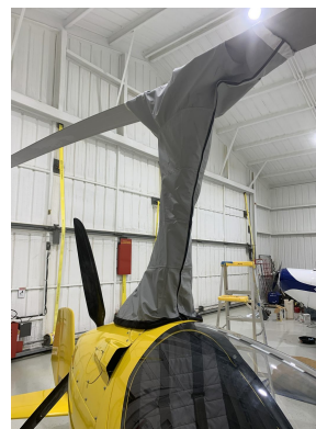
Calidus Gyrocopter Rotor Mast Cover, test fit cover