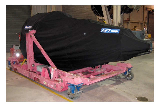
CFM-56-7 Off-link Engine Shipper/Transport cover, w/ Exhaust Cone, fully enclosed