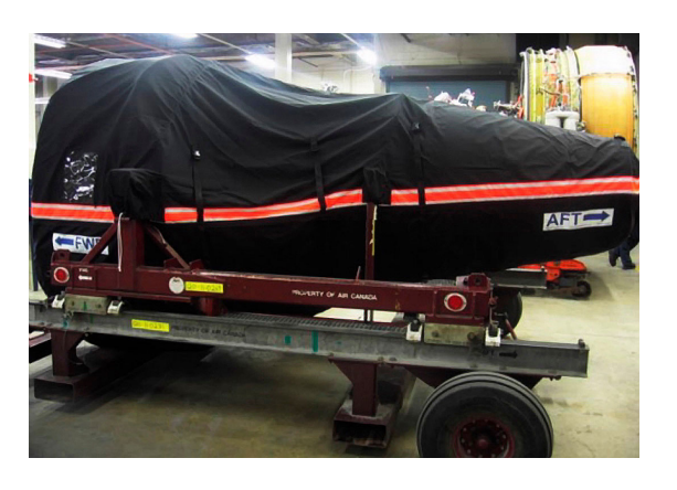
CFM-56-5A/5B Off-link Engine Shipper/Transport cover, w/ Exhaust Cone, fully enclosed