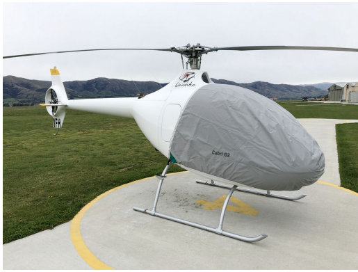
Guimbal Cabri CG2 Bubble Cover, light weight travel type