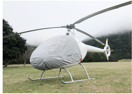
Guimbal Cabri CG2 Bubble Cover, light weight travel type