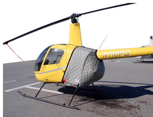
Robinson R-22 Insulated Engine Cover (also covers bottom) & Front Blade Tie-down