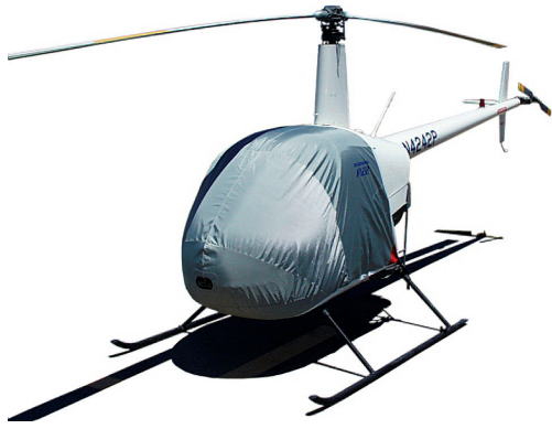
Robinson R-22 Standard Bubble Cover