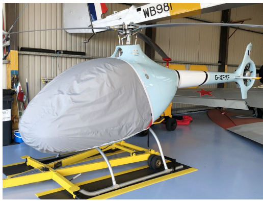
Cabri G2 Light Weight Travel Bubble Cover