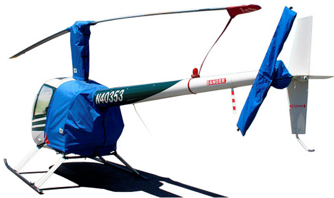
Robinson R-22 Engine, Rotor Mast & Tail Rotor Covers, with Blade Tie-down