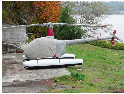
Robinson R-22 Bubble Cover (Ext. Past Rotor Hub), Engine Cover, Tailboom Cover, Blade Covers, Rotor Hub Cover, & Tail Rotor Gear Box Cover