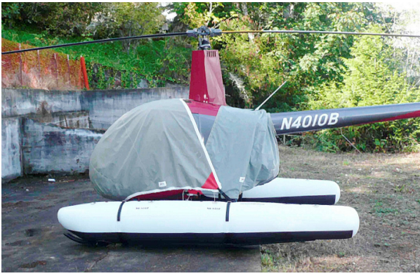
Robinson R-22 Standard Bubble Cover & Engine Cover