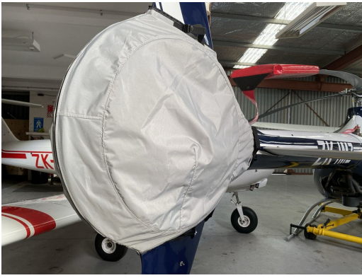
Guimbal Cabri G2 Tailfan Housing Fenestron Cover