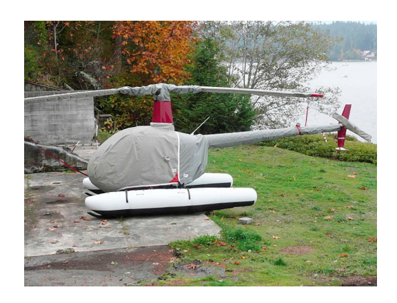
Robinson R-22 Bubble Cover (Ext. Past Rotor Hub), Engine Cover, Tailboom Cover, Blade Covers, Rotor Hub Cover, & Tail Rotor Gear Box Cover