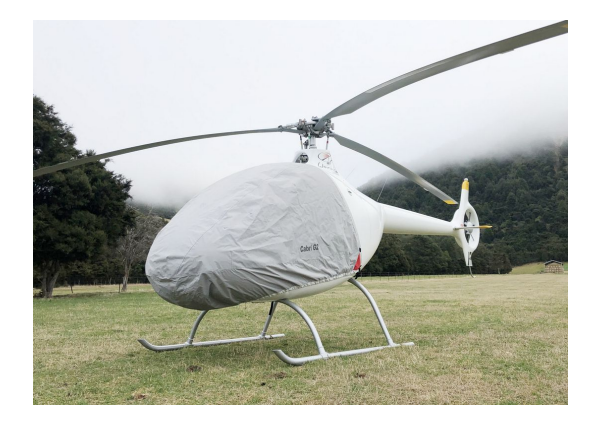
Guimbal Cabri CG2 Bubble Cover, light weight travel type