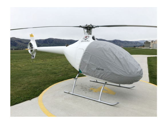
Guimbal Cabri CG2 Bubble Cover, light weight travel type

Travel Covers are made with Silver Solution-Dyed Polyester fabric and fully lined over the entire cover. The material is lightweight and more compact for easy stowage in the aircraft. The polyester material is water resistant, but only intended for occasional use outside. We also have an ultra lightweight material available for fitted hangar dust covers. For daily outdoor use, the non-travel Sunbrella Cover is the best choice.