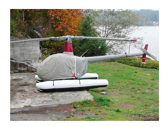
Robinson R-22 Bubble Cover (Ext. Past Rotor Hub), Engine Cover, Tailboom Cover, Blade Covers, Rotor Hub Cover, & Tail Rotor Gear Box Cover