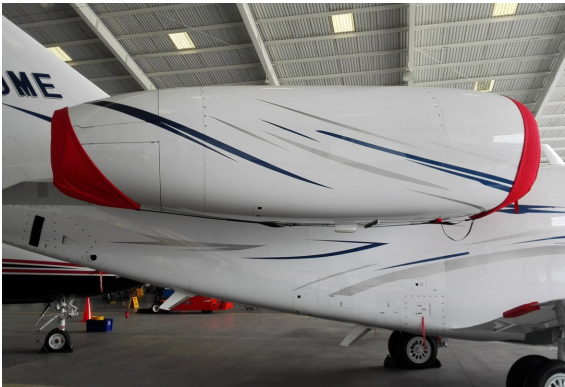
Citation X Intake/Exhaust Cover Set