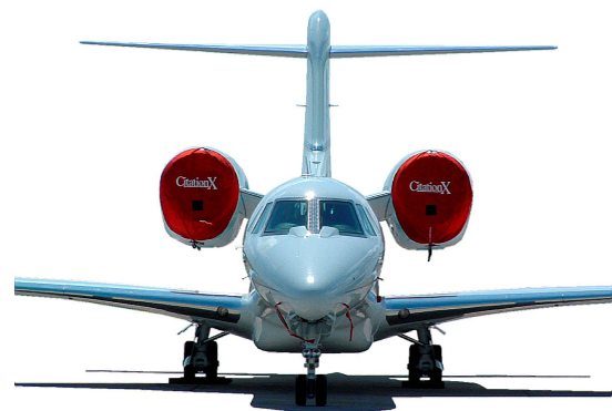
Citation X Intake Covers