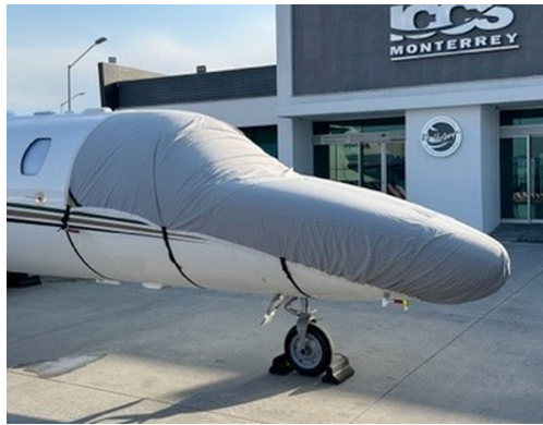
Cessna Citationjet 525B Travel Weight Cockpit/Nose Cover

Travel Covers are made with Silver Solution-Dyed Polyester fabric and only lined over the windshield to save weight. The material is lightweight and more compact for easy stowage in the aircraft. The polyester material is water resistant, but only intended for occasional use outside. We also have an ultra lightweight material available for fitted hangar dust covers. For daily outdoor use, the non-travel Sunbrella Cover is the best choice.