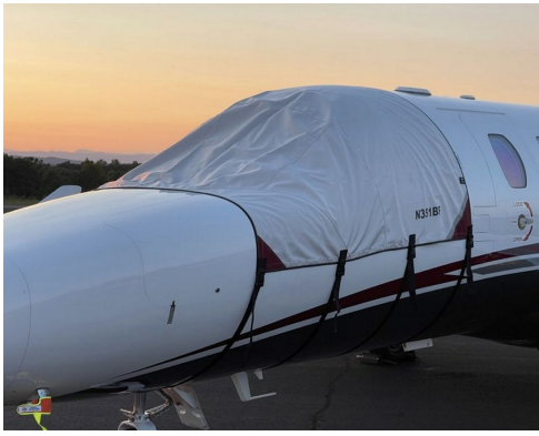
Cessna Citation Jet 525 Cockpit Cover