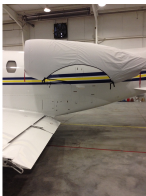
Cessna Citation 560XL Upper Nacelle/Brightwork Covers