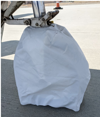
CJ1 Nose Gear Tire Cover, test fit

ALL-YEAR USE MATERIAL - Made with Silver Acrylic Sunbrella canvas, the all-year use material is the best option for sun protection and cover longevity. This heavier more durable material is intended for all weather conditions, such as rain and snow or lots of sun.