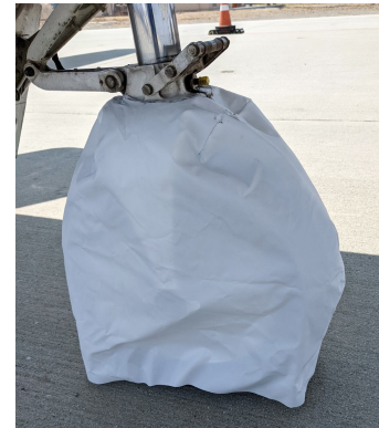
CJ1 Nose Gear Tire Cover, test fit