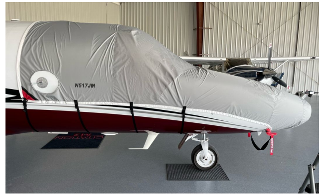
Cessna Citationjet M2 Light Weight Travel Cockpit/Nose Cover