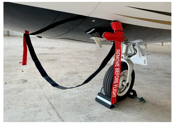
Cessna Citationjet CJ1 Pitot Cover Set