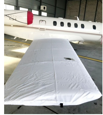
Cessna Citation CJ-4 Wing Covers, test fit cover