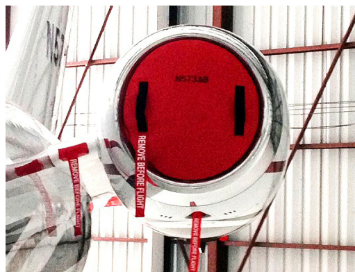
Citation CJ4 Intake Plugs pair