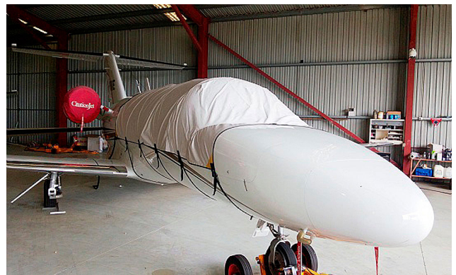
Citation CJ-1 Canopy Cover and Engine Covers