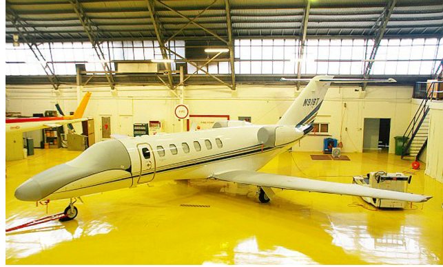
Cessna Citationjet CJ3 Cockpit/Nose, Engine & Wings Travel Covers