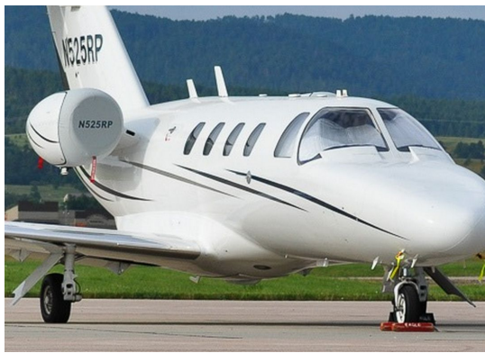
Cessna Citationjet CJ1 Bikini Type Engine Covers