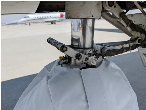
CJ1 Nose Gear Tire Cover, test fit

ALL-YEAR USE MATERIAL - Made with Silver Acrylic Sunbrella canvas, the all-year use material is the best option for sun protection and cover longevity. This heavier more durable material is intended for all weather conditions, such as rain and snow or lots of sun.