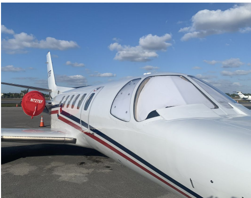
Cessna Citation S550

Custom-made Heatshield Sunshades are available for almost any window in the jet. Side windows, Skylights, and Emergency Exits are all custom-made. The product is a unique composite of closed-cell foam with a silver mylar finish. The set is easily stored in the included storage sleeve. Some designs may require velcro and suction cups. Our Heatshields are offered white side out since aircraft manufacturers have issued advisories against reflective window inserts due to potential heat damage.