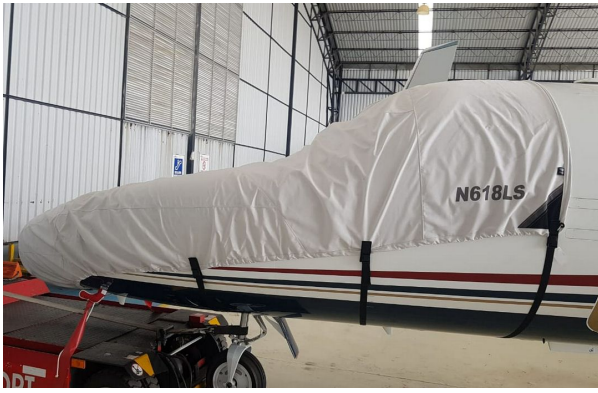
Citationjet 525B Cockpit/Nose Cover