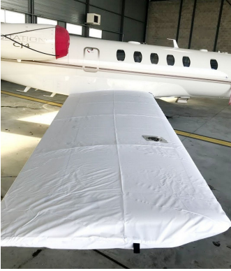
Cessna Citation CJ-4 Wing Covers, test fit cover

WINTER USE MATERIAL - Made with Solution-Dyed Polyester fabric, this option is intended for seasonal use to aid in deicing, rain mitigation, or for occasional travel. The material is lighter and more compact, but more susceptible to UV damage and may have a shorter useful life if used continuously outside than the all-year use material.