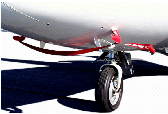
Cessna Citation I Pitot Covers