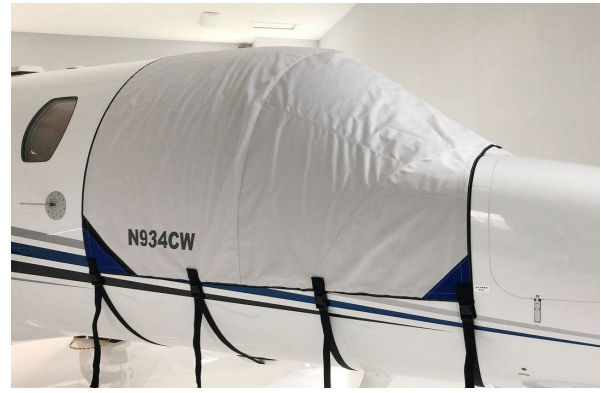
Cessna Citation M2 Cockpit Cover