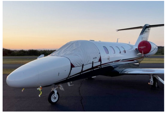
Cessna Citation Jet 525 Cockpit Cover