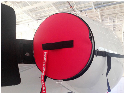
Cessna CJ1 Exhaust Plug