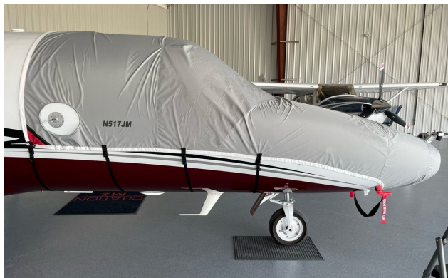
Cessna Citationjet M2 Light Weight Travel Cockpit/Nose Cover

Travel Covers are made with Silver Solution-Dyed Polyester fabric and only lined over the windshield to save weight. The material is lightweight and more compact for easy stowage in the aircraft. The polyester material is water resistant, but only intended for occasional use outside. We also have an ultra lightweight material available for fitted hangar dust covers. For daily outdoor use, the non-travel Sunbrella Cover is the best choice.