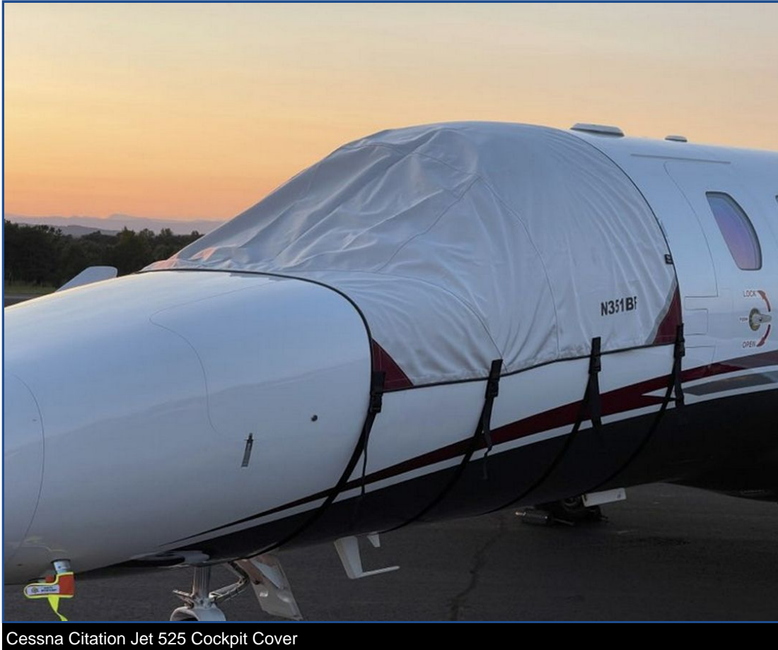
Cessna Citation Jet 525 Cockpit Cover