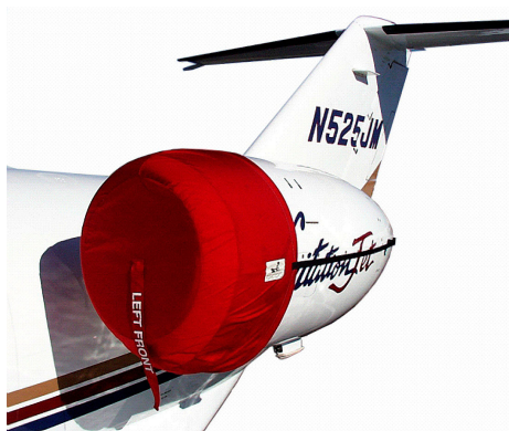
Engine Inlet Cover