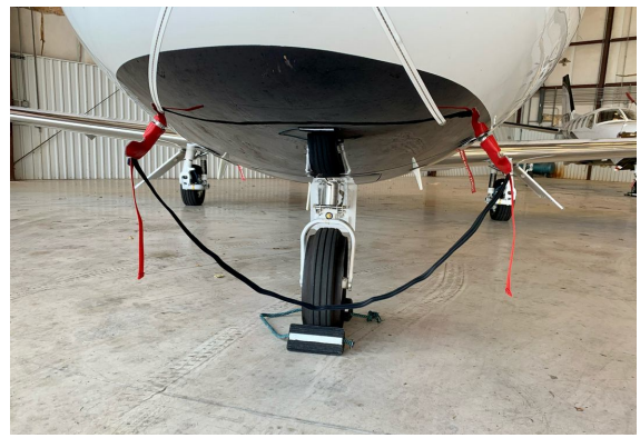
Cessna Citationjet CJ1 Pitot Cover Set