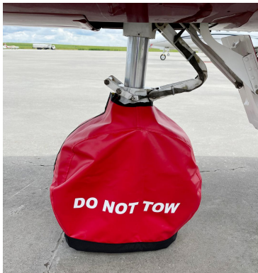
Citationjet CJ-3 Nose Gear Tire Cover

ALL-YEAR USE MATERIAL - Made with Silver Acrylic Sunbrella canvas, the all-year use material is the best option for sun protection and cover longevity. This heavier more durable material is intended for all weather conditions, such as rain and snow or lots of sun.