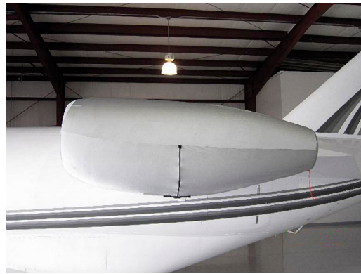
Citation CJ3 Bikini Style Engine Cover Set, full nacelle enclosure