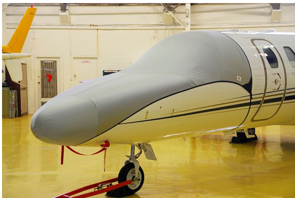
Citationjet CJ3 Cockpit/Nose Travel Cover

This cover type is made from Silver Acrylic Sunbrella canvas and is 100% lined with a soft and smooth microfiber. Bruce's Custom Covers developed this material combination especially for aircraft protection. The outer material is medium weight and treated for water resistance, UV resistance and anti-static buildup. The inner lining is a very soft and smooth microfiber to prevent scratching. The material is very reflective, and tests show that the cabin interior temperature can be reduced to near-ambient temperature on the hottest of days. It is water, ice and snow repellent, yet breathable to allow moisture to escape from between the cover and the aircraft surface.