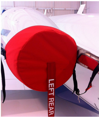
Citation CJ3 Exhaust Cover

The Cessna Citationjet 525B, CJ-3 Intake/Exhaust Plugs are custom fit for the intake and exhaust openings, made with heavy-duty vinyl material, and stuffed with a single block of sculpted urethane foam. Each plug has a zipper that allows the foam to be removed and dried if necessary. Engine plugs have 'remove before flight' streamers sewn onto the face of the plugs. Most plugs are imprinted with the aircraft registration number in black. Engine plugs may be inserted after flight when the engine is still warm. Engine Inlet Plugs are commonly referred to as Cowl Plugs, Intake Plugs, Cowl Blocks, Engine Blocks, and Engine Bungs.