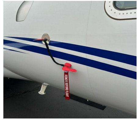
Citationjet CJ4 Pitot/AOA Covers