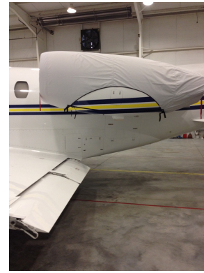
Cessna Citation 560XL Upper Nacelle/Brightwork Covers