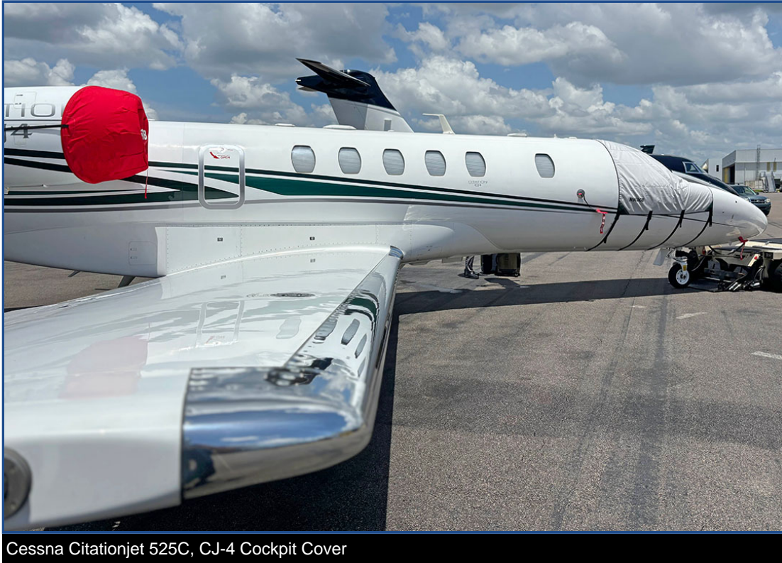
Cessna Citationjet 525C, CJ-4 Cockpit Cover