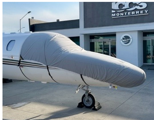
Citation CJ4 Cockpit/Nose Cover and Heat Resistant Pitot Covers set Cessna Citationjet 525B Travel Weight Cockpit/Nose Cover