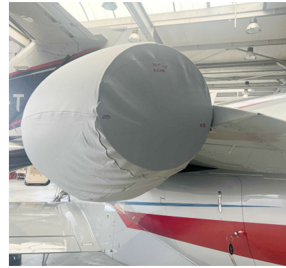
Citationjet 525C, CJ4, Complete Nacelle Cover, light weight Spandex