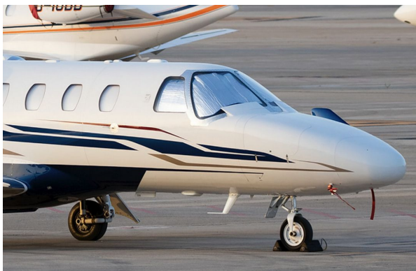
Cessna Citationjet 525, CJ-I, CJ1+, & M2 Cockpit Heatshields

Cockpit Heatshields are interior sunshades for the aircraft's cockpit. The product is a unique composite of closed-cell foam with a silver mylar finish. The semi-rigid design is stiff enough to stand inside the window framing. The set folds up flat and is easily stored in the included storage sleeve. Some designs may require velcro and suction cups. Our Heatshields for jets are offered white side out because some aircraft manufacturers have issued advisories against reflective window inserts due to potential heat damage. A Heatshield is an excellent short-term remedy for cockpit overheating, but an external fabric cover is more effective for long-term protection.