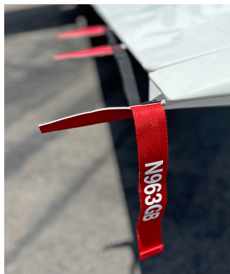
Cessna Citationjet 525C, CJ-4 Static Wick Protectors, 3 Per Wing, 1 On Tailcone Area