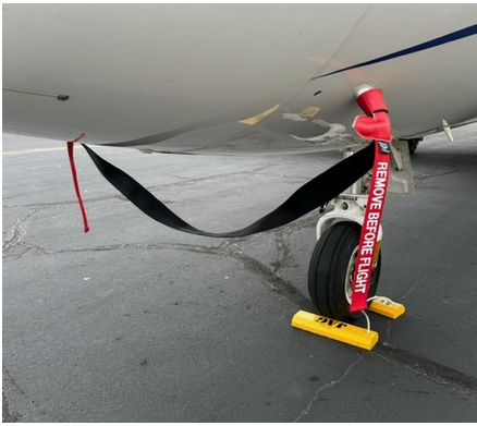
Citationjet CJ4 Pitot Covers