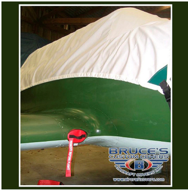
CJ6 Canopy Cover & Leading Edge Inlet Plug