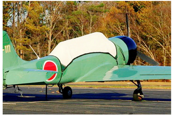
Yak 52 Canopy Cover