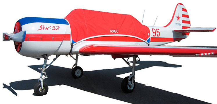
Yak 52 Canopy Cover