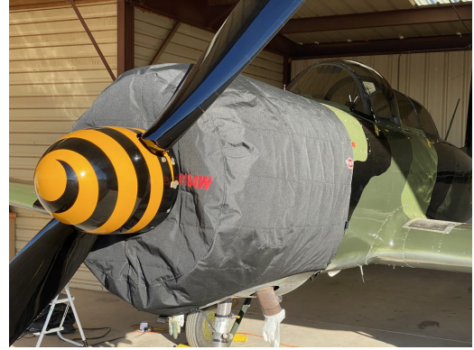
Nanchang CJ6 Insulated Engine Cover