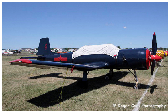
CJ-6 Nanchang Canopy Cover