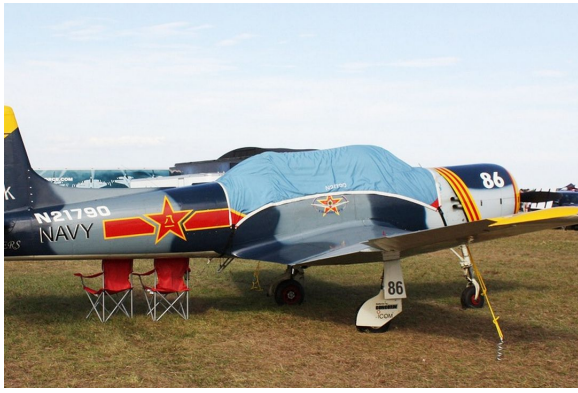
Malcomb Hood cover for a CJ-6