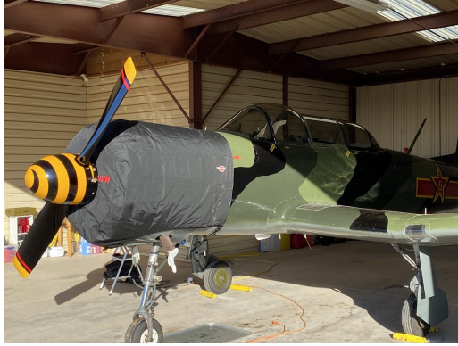
Nanchang CJ6 Insulated Engine Cover

The material is very reflective, and tests show that the cabin interior temperature can be reduced to near-ambient temperature on the hottest of days. It is water, ice and snow repellent, yet breathable to allow moisture to escape from between the cover and the aircraft surface.