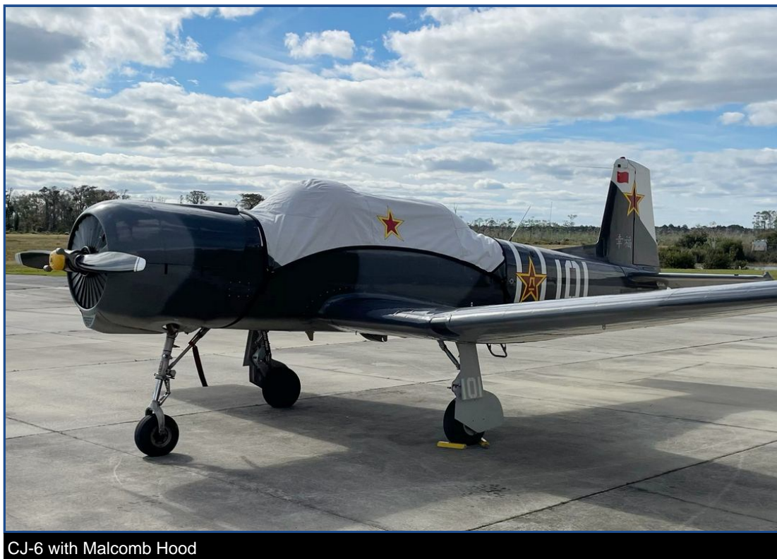
CJ-6 with Malcomb Hood