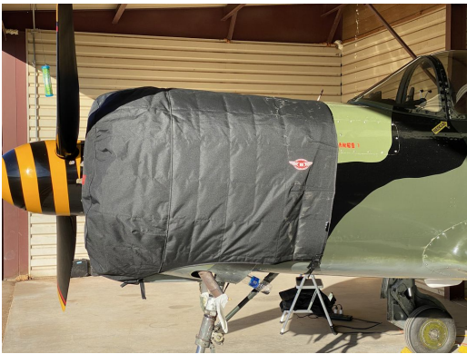
Nanchang CJ6 Insulated Engine Cover