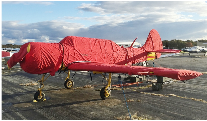
Yak 52 Full Cover Set