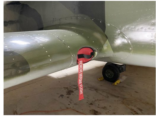
Nanchang CJ-6A Leading Edge Plug