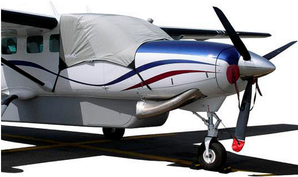
Cessna Caravan Cockpit Cover, Plugs, Prop Ties & Pitot Cover

water resistance, UV resistance and anti-static buildup. The inner lining is a very soft and smooth microfiber to prevent scratching. The material is very reflective, and tests show that the cabin interior temperature can be reduced to near-ambient temperature on the hottest of days. It is water, ice and snow repellent, yet breathable to allow moisture to escape from between the cover and the aircraft surface.