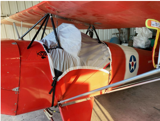
Corben Junior Ace Travel Weight Canopy Cover