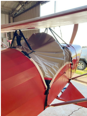
Corben Junior Ace Travel Weight Canopy Cover