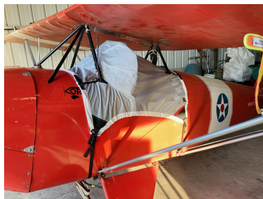
Corben Junior Ace Travel Weight Canopy Cover