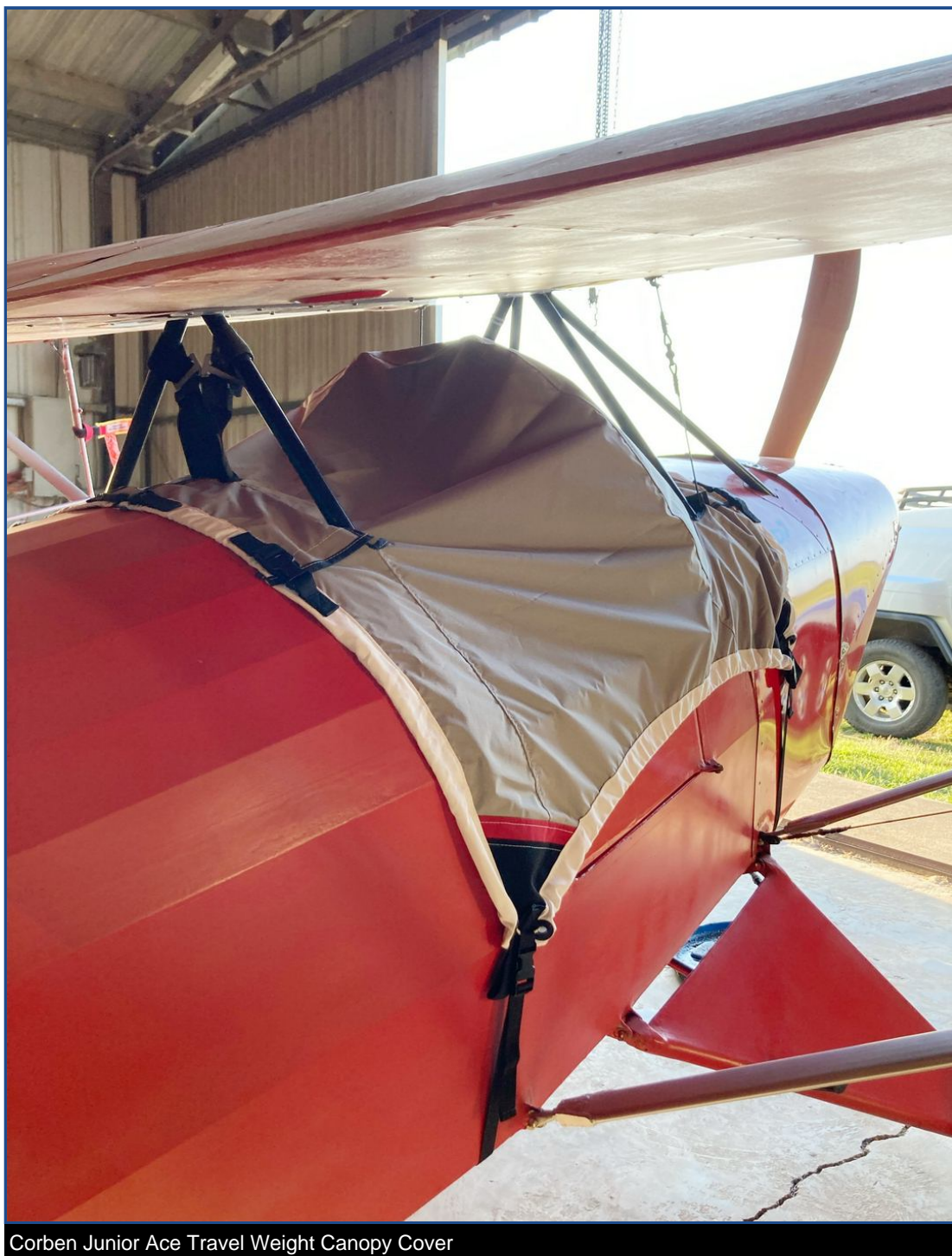
Corben Junior Ace Travel Weight Canopy Cover