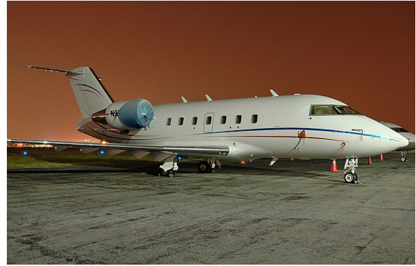
Challenger 601 Intake Covers, standard design