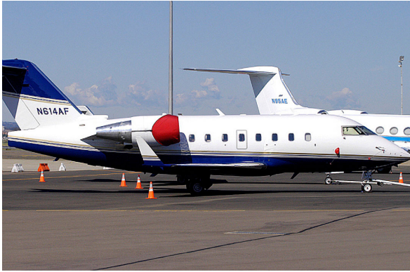
Challenger 604 Intake Covers, standard design

The Canadair Regional Jet 200, 700 Bikini Style Engine Covers are a single-piece design using a soft and smooth stretchy and fabric. The cover stretches tightly over both the intake and exhaust, installing quickly and easily. These covers are designed to be used as hangar dust covers and have a useful life of approximately one year.