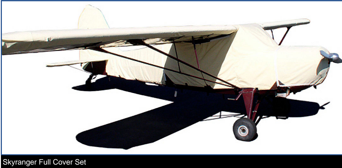
Skyranger Full Cover Set