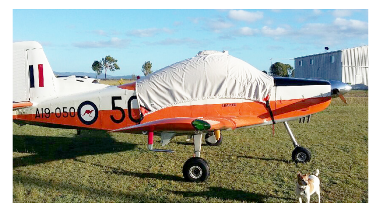
Pacific Aerospace CT-4 Canopy Cover