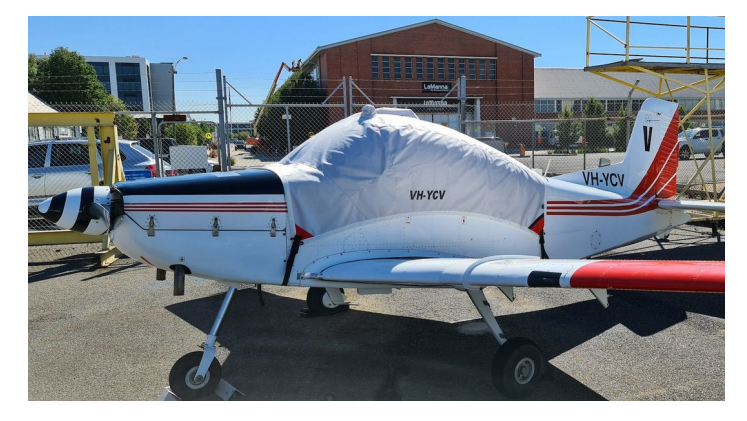
Pacific Aerospace CT-4, Victa Airtourer Canopy Cover

This cover type is made from Silver Acrylic Sunbrella canvas and is 100% lined with a soft and smooth microfiber. Bruce's Custom Covers developed this material combination especially for aircraft protection. The outer material is medium weight and treated for water resistance, UV resistance and anti-static buildup. The inner lining is a very soft and smooth microfiber to prevent scratching. The material is very reflective, and tests show that the cabin interior temperature can be reduced to near-ambient temperature on the hottest of days. It is water, ice and snow repellent, yet breathable to allow moisture to escape from between the cover and the aircraft surface.