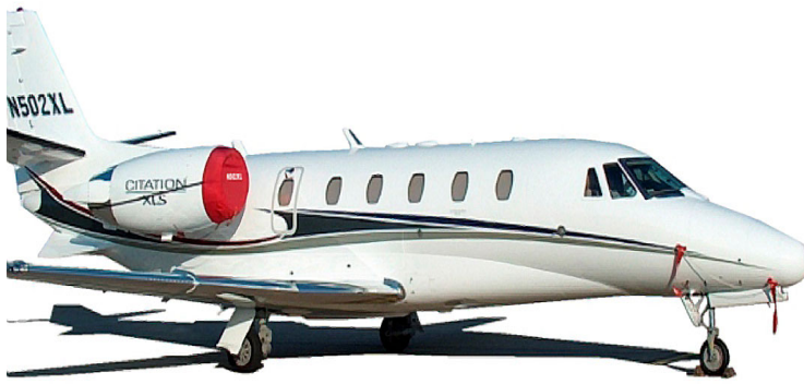
Citation 560XL Engine Intake Covers