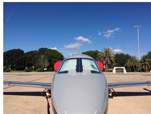
Cessna Citation XL, XLS (560XL) Cockpit Heatshields