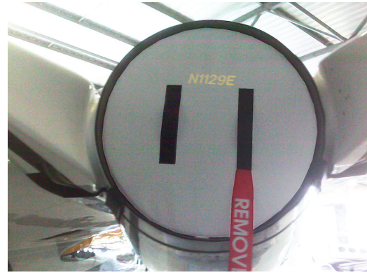
Citation XLS Exhaust Plugs