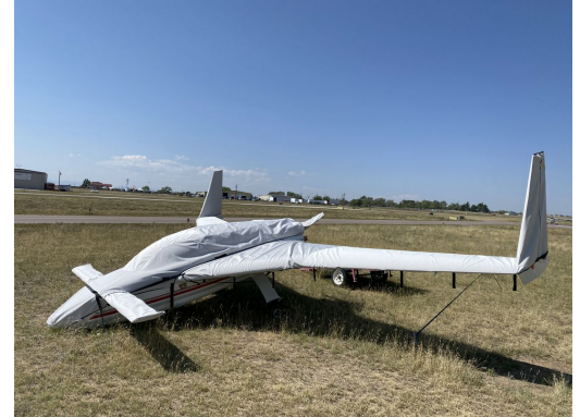
Cozy Mk IV Complete Cover Set