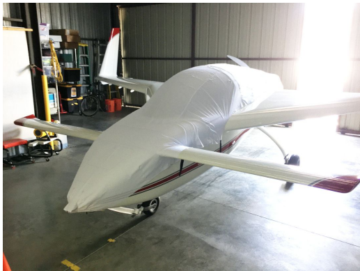
Cozy Canopy/Nose/Engine Cover, test fit cover

water resistance, UV resistance and anti-static buildup. The inner lining is a very soft and smooth microfiber to prevent scratching. The material is very reflective, and tests show that the cabin interior temperature can be reduced to near-ambient temperature on the hottest of days. It is water, ice and snow repellent, yet breathable to allow moisture to escape from between the cover and the aircraft surface.