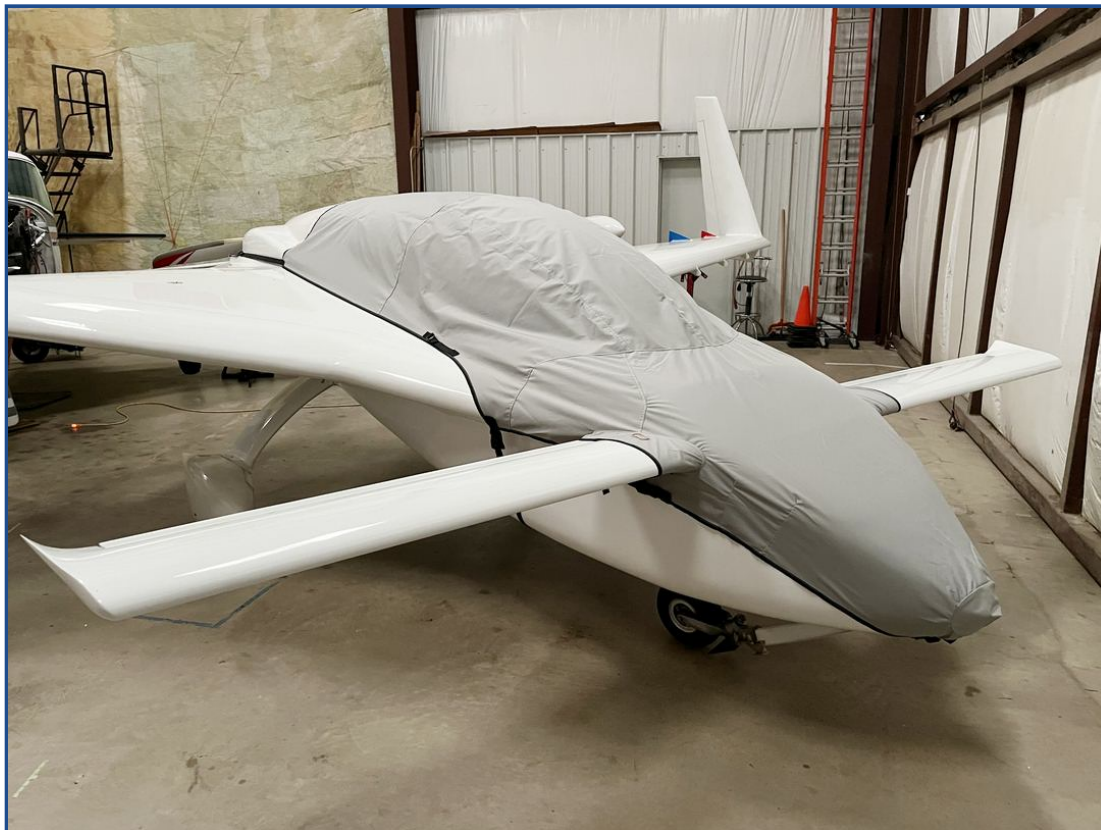
Cozy Mk IV Canopy/Nose Cover, travel weight