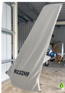
Cozy All Models Vertical Stabilizer Covers, All Year Use

WINTER USE MATERIAL - Made with Solution-Dyed Polyester fabric, this option is intended for seasonal use to aid in deicing, rain mitigation, or for occasional travel. The material is lighter and more compact, but more susceptible to UV damage and may have a shorter useful life if used continuously outside than the all-year use material.