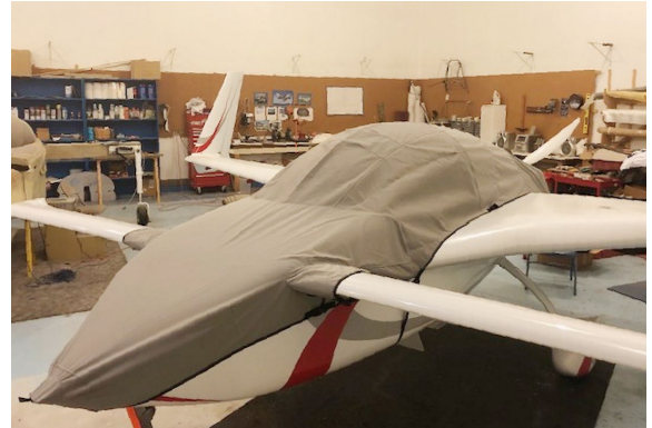
Cozy MK IV Travel Weight Canopy/Nose Cover