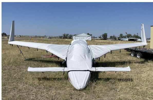
Cozy Mk IV Complete Cover Set