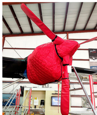
Twin Otter Wing, Horiz. Stab & Engine Covers