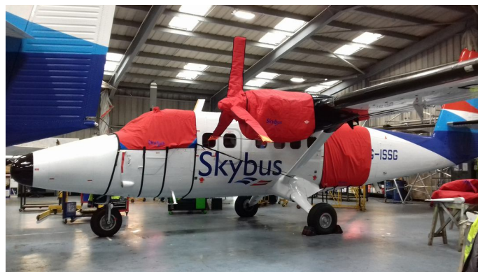
DeHavilland Twin Otter DHC6 (UV-18A) Cockpit Cover (CUSTOM COLOR)