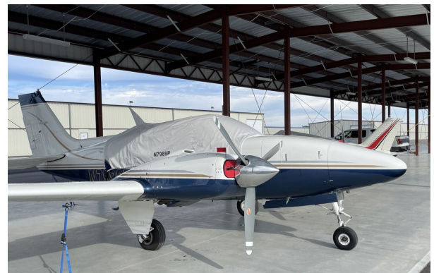
Beech Baron D55 Canopy Cover, Engine Plugs