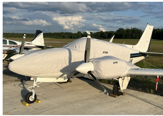
Beech C55 Baron Extended Canopy/Nose Cover, Engine Covers