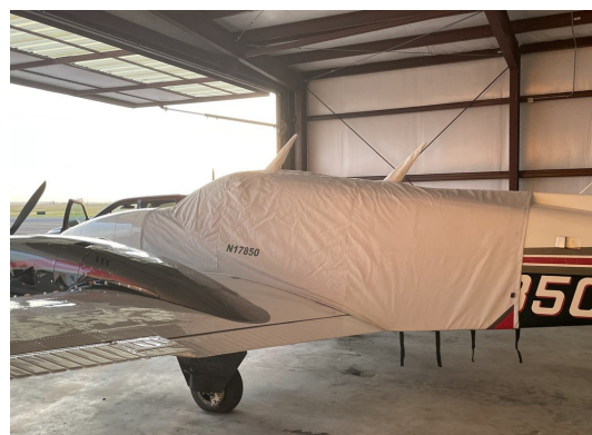
Beech Baron 58TC Extended Canopy Cover