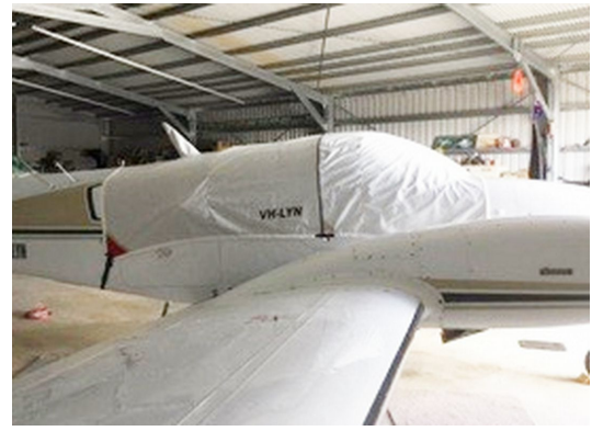
Beech Baron B-55 Canopy Cover