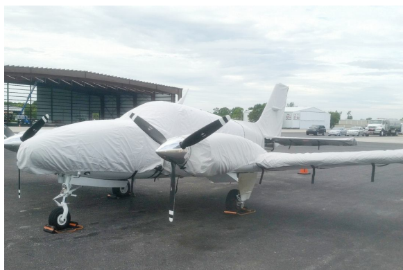
Full Cover Set (58P-020, 58P-225, 58P-405)

WINTER USE MATERIAL - Made with Solution-Dyed Polyester fabric, this option is intended for seasonal use to aid in deicing, rain mitigation, or for occasional travel. The material is lighter and more compact, but more susceptible to UV damage and may have a shorter useful life if used continuously outside than the all-year use material.