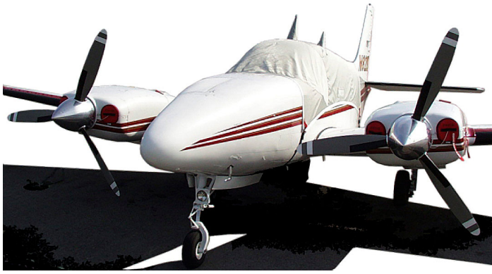
Baron 58 Standard Canopy Cover & Engine Plugs