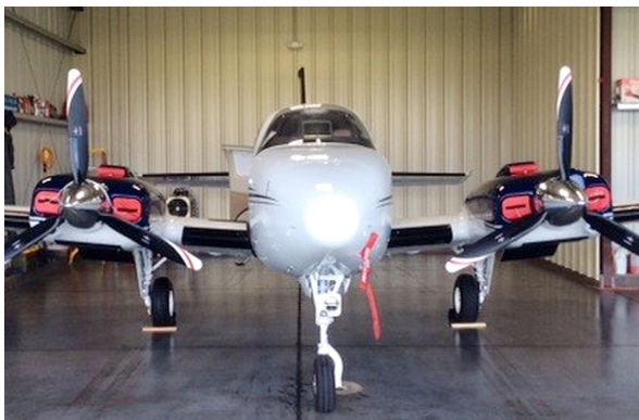
Beech Baron 58 Engine Inlet Plugs, Cowl Top Plugs, Heater Inlet, Pitot Cover

Engine Inlet Plugs are custom fit for your Beech Baron D55 & E55 intakes, made with heavy-duty vinyl material, and stuffed with a single block of sculpted urethane foam. Each plug has a zipper that allows the foam to be removed and dried if necessary. Engine plugs have warning flags that are visible from the cockpit or 'remove before flight' streamers sewn onto the face of the plugs. Most plugs are imprinted with the aircraft registration number in black for an extra charge. Storage bag NOT included. Engine plugs may be inserted after flight when the engine is still warm. Engine Inlet Plugs are commonly referred to as Cowl Plugs, Intake Plugs, Cowl Blocks, Engine Blocks, and Engine Bungs.