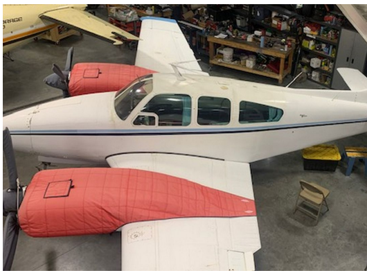
Beech Baron B55 Insulated Engine Covers