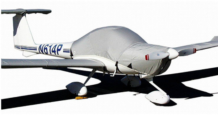
Diamond DA-20 Canopy/Engine, Wing & Horiz. Stab. Covers