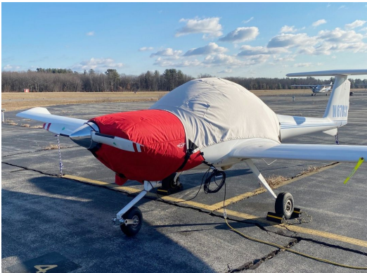
Diamond DA20-C1 Insulated Engine Cover, C1 models

This cover type is made from Silver Acrylic Sunbrella canvas and is 100% lined with a soft and smooth microfiber. Bruce's Custom Covers developed this material combination especially for aircraft protection. The outer material is medium weight and treated for water resistance, UV resistance and anti-static buildup. The inner lining is a very soft and smooth microfiber to prevent scratching. The material is very reflective, and tests show that the cabin interior temperature can be reduced to near-ambient temperature on the hottest of days. It is water, ice and snow repellent, yet breathable to allow moisture to escape from between the cover and the aircraft surface.