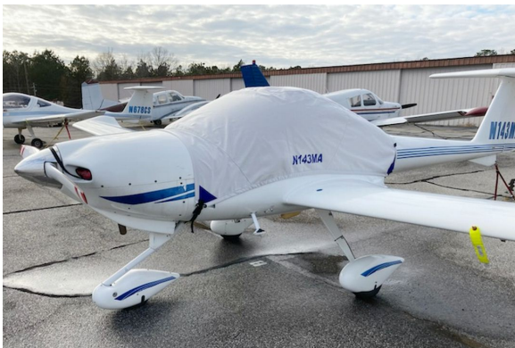
Diamond DA20-C1 Canopy Cover

This cover type is made from Silver Acrylic Sunbrella canvas and is 100% lined with a soft and smooth microfiber. Bruce's Custom Covers developed this material combination especially for aircraft protection. The outer material is medium weight and treated for water resistance, UV resistance and anti-static buildup. The inner lining is a very soft and smooth microfiber to prevent scratching. The material is very reflective, and tests show that the cabin interior temperature can be reduced to near-ambient temperature on the hottest of days. It is water, ice and snow repellent, yet breathable to allow moisture to escape from between the cover and the aircraft surface.