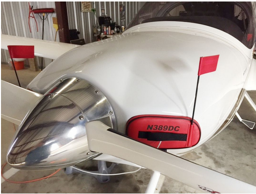
Diamond DA-20-C1 Engine Inlet Plugs

Engine Inlet Plugs are custom fit for your Diamond DA-20, Katana, Eclipse intakes, made with heavy-duty vinyl material, and stuffed with a single block of sculpted urethane foam. Each plug has a zipper that allows the foam to be removed and dried if necessary. Engine plugs have warning flags that are visible from the cockpit or 'remove before flight' streamers sewn onto the face of the plugs. Most plugs are imprinted with the aircraft registration number in black for an extra charge. Storage bag NOT included. Engine plugs may be inserted after flight when the engine is still warm. Engine Inlet Plugs are commonly referred to as Cowl Plugs, Intake Plugs, Cowl Blocks, Engine Blocks, and Engine Bungs.