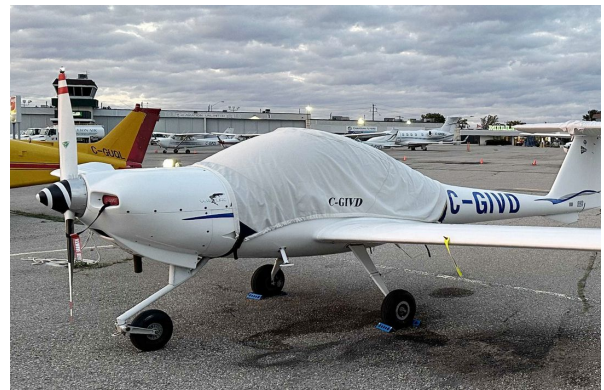
Diamond DA-20 Canopy Cover