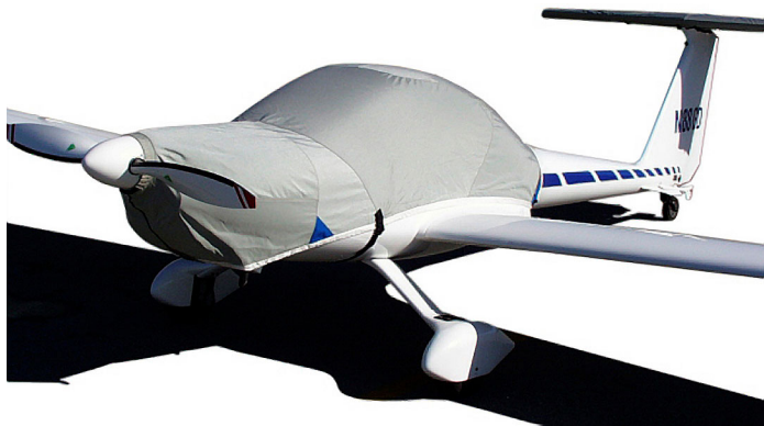
Diamond DA-20 Canopy/Engine Cover

This cover type is made from Silver Acrylic Sunbrella canvas and is 100% lined with a soft and smooth microfiber. Bruce's Custom Covers developed this material combination especially for aircraft protection. The outer material is medium weight and treated for water resistance, UV resistance and anti-static buildup. The inner lining is a very soft and smooth microfiber to prevent scratching. The material is very reflective, and tests show that the cabin interior temperature can be reduced to near-ambient temperature on the hottest of days. It is water, ice and snow repellent, yet breathable to allow moisture to escape from between the cover and the aircraft surface.