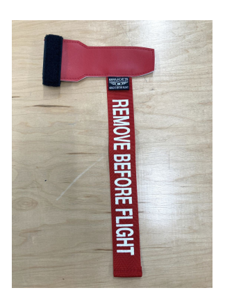
Pitot Tube Cover