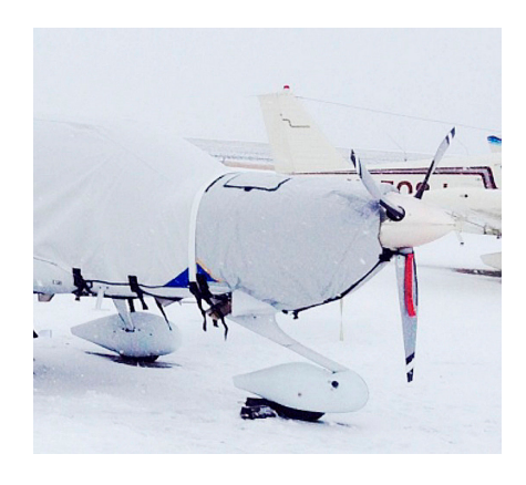
Diamond DA-40 Insulated Engine Cover