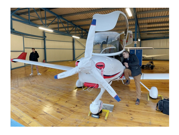
DA40 NG Engine Plugs

Designed to prevent damage to the aircraft extremities in crowded hangars, these products are made of bright red Naugahyde and thickly padded with a sandwich of closed cell foam.