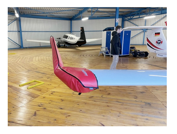
Diamond DA-40 Wingtip Pads