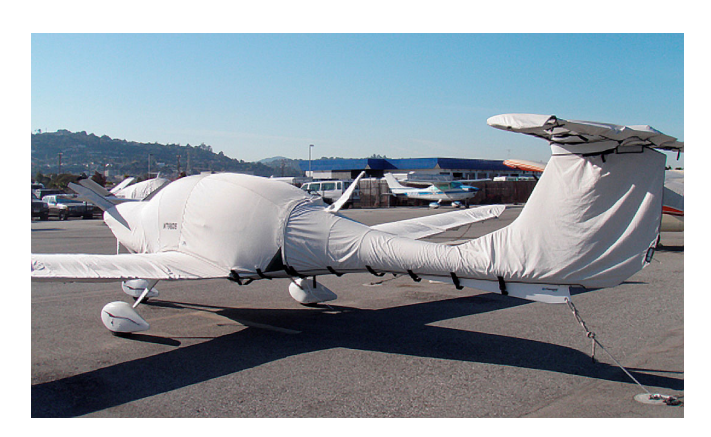
Diamond DA-40 Full Cover Set