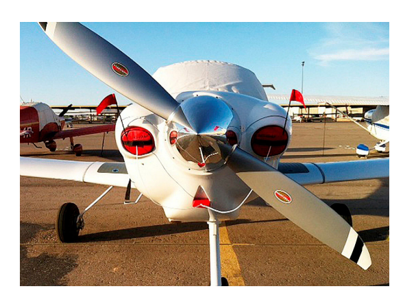
Diamond DA-40 Engine Inlet Plugs (set of 3)