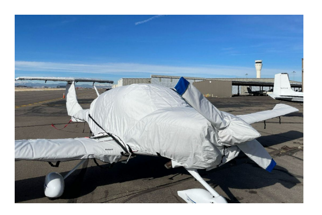
Diamond DA-40 Full Cover Set