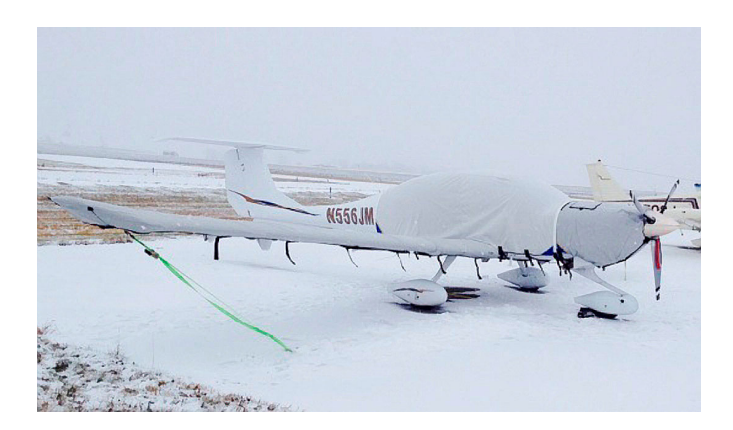
Diamond DA-40 Extended Canopy Cover, Wing Covers & Insulated Engine Cover

This cover type is made from Silver Acrylic Sunbrella canvas and is 100% lined with a soft and smooth microfiber. Bruce's Custom Covers developed this material combination especially for aircraft protection. The outer material is medium weight and treated for water resistance, UV resistance and anti-static buildup. The inner lining is a very soft and smooth microfiber to prevent scratching. The material is very reflective, and tests show that the cabin interior temperature can be reduced to near-ambient temperature on the hottest of days. It is water, ice and snow repellent, yet breathable to allow moisture to escape from between the cover and the aircraft surface.