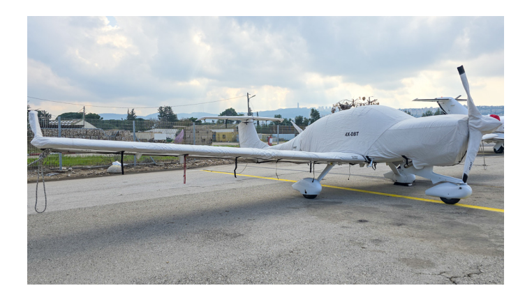
Diamond DA-40 Complete Cover Set