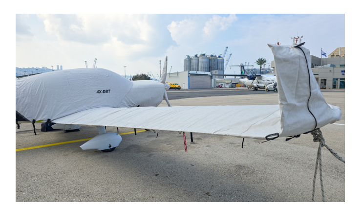
Diamond DA-40 Complete Cover Set

WINTER USE MATERIAL - Made with Solution-Dyed Polyester fabric, this option is intended for seasonal use to aid in deicing, rain mitigation, or for occasional travel. The material is lighter and more compact, but more susceptible to UV damage and may have a shorter useful life if used continuously outside than the all-year use material.