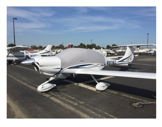
Diamond DA-40 Travel Cover, Light Weight Travel Canopy Cover