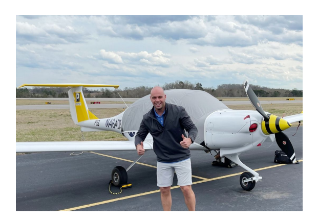
Diamond DA-40 Light Weight Travel Cover