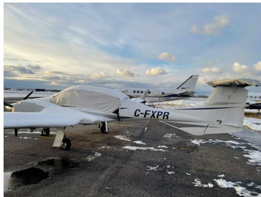
Diamond DA-42 Canopy, Wing, Engine & Horizontal Stabilizer Covers