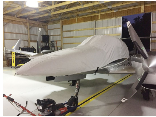
Diamond DA42-VI Canopy and Nose Cover