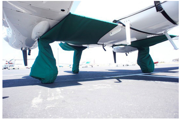
Twinstar Landing Gear & Gearwell Covers