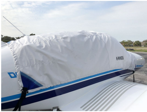
Diamond DA-42 Twin Star Canopy Cover