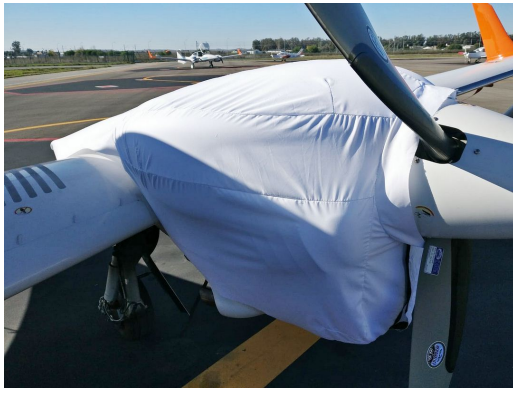
DA42 MPP Guardian (DA42-NG) Engine Cover, test fit cover