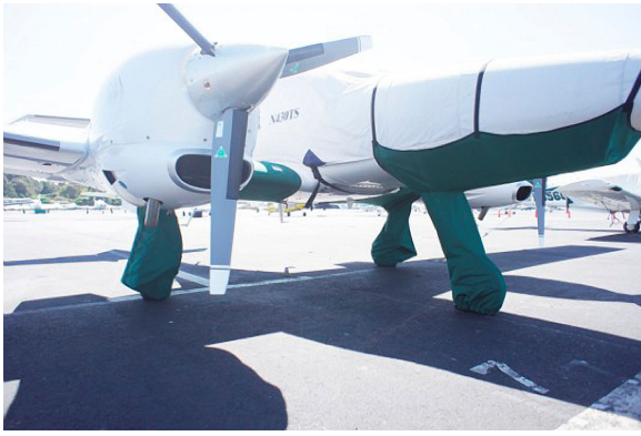
Twinstar Landing Gear & Gearwell Covers