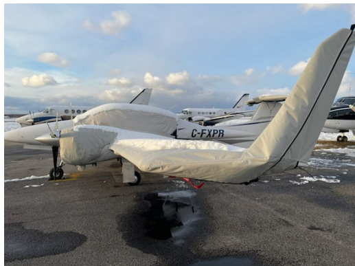
Diamond DA-42 Canopy, Wing, Engine & Horizontal Stabilizer Covers

WINTER USE MATERIAL - Made with Solution-Dyed Polyester fabric, this option is intended for seasonal use to aid in deicing, rain mitigation, or for occasional travel. The material is lighter and more compact, but more susceptible to UV damage and may have a shorter useful life if used continuously outside than the all-year use material.