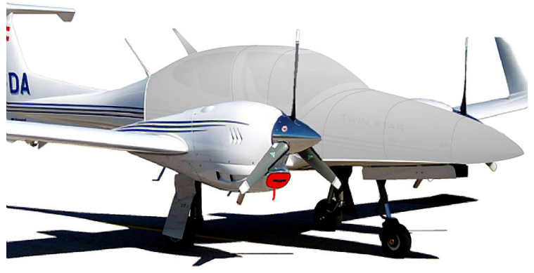
Twinstar Extended Canopy/Nose Cover & Engine Plugs (Illustration)