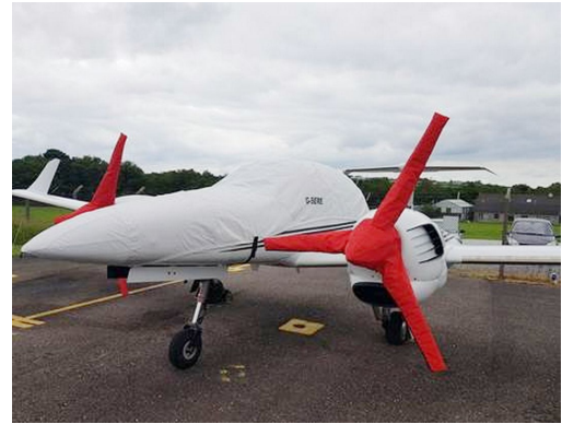
Diamond DA-42 Canopy/Nose and Insulated Prop Covers