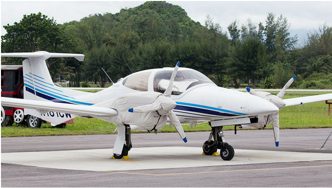
Diamond DA-42NG Engine & Prop Covers

The material is very reflective, and tests show that the cabin interior temperature can be reduced to near-ambient temperature on the hottest of days. It is water, ice and snow repellent, yet breathable to allow moisture to escape from between the cover and the aircraft surface.