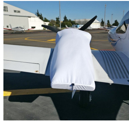
DA42 MPP Guardian (DA42-NG) Engine Cover, test fit cover