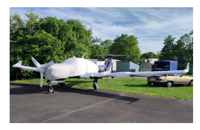
Diamond DA-50 Extended Canopy/Engine, Prop & Wing Covers (test fit)

WINTER USE MATERIAL - Made with Solution-Dyed Polyester fabric, this option is intended for seasonal use to aid in deicing, rain mitigation, or for occasional travel. The material is lighter and more compact, but more susceptible to UV damage and may have a shorter useful life if used continuously outside than the all-year use material.