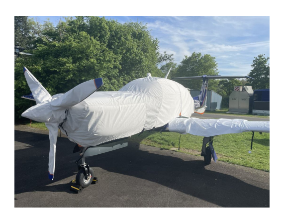
Diamond DA-50 Extended Canopy/Engine, Prop & Wing Covers (test fit)