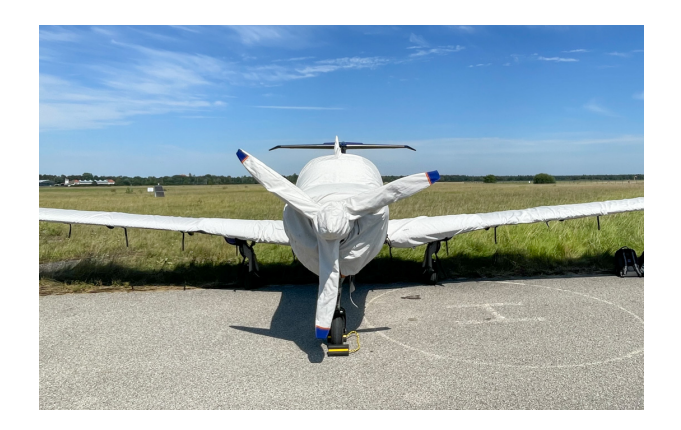
Diamond DA-50 Extended Canopy/Engine Cover, Wing & Prop Covers