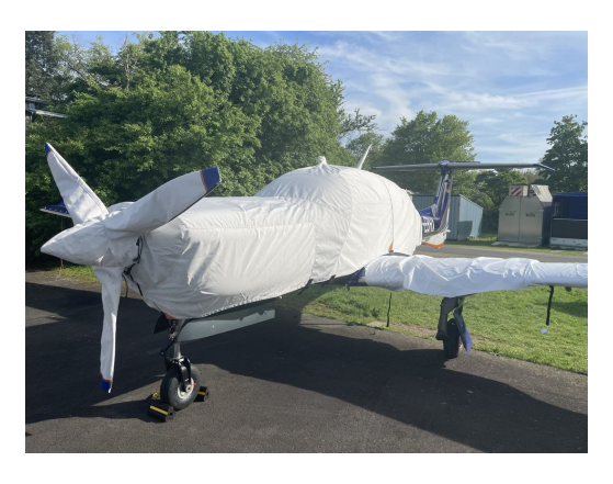
Diamond DA-50 Extended Canopy/Engine, Prop & Wing Covers Diamond DA-50 Extended Canopy/Engine, Prop & Wing Covers (test fit) (test fit)