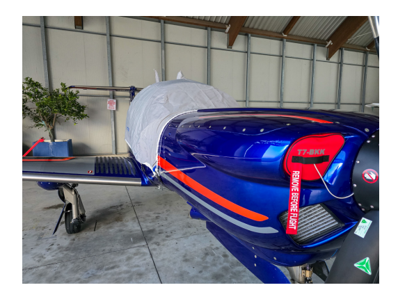
Diamond DA-50 Canopy Cover, Engine Plugs

Engine Inlet Plugs are custom fit for your Diamond DA-50 Superstar intakes, made with heavy-duty vinyl material, and stuffed with a single block of sculpted urethane foam. Each plug has a zipper that allows the foam to be removed and dried if necessary. Engine plugs have warning flags that are visible from the cockpit or 'remove before flight' streamers sewn onto the face of the plugs. Most plugs are imprinted with the aircraft registration number in black for an extra charge. Storage bag NOT included. Engine plugs may be inserted after flight when the engine is still warm. Engine Inlet Plugs are commonly referred to as Cowl Plugs, Intake Plugs, Cowl Blocks, Engine Blocks, and Engine Bungs.