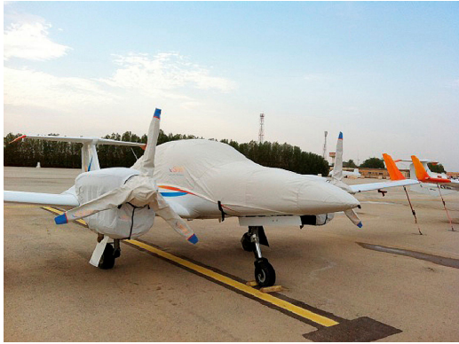
Diamond DA-42NG Canopy/Nose, Engine & Prop Covers