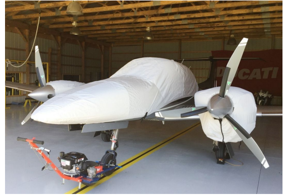
Diamond DA-42-VI Canopy/Nose & Engine Covers