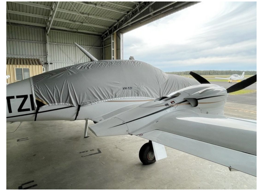
DA-62 Travel Weight Canopy/Nose Cover