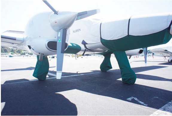
Twinstar Landing Gear &amp; Gearwell Covers