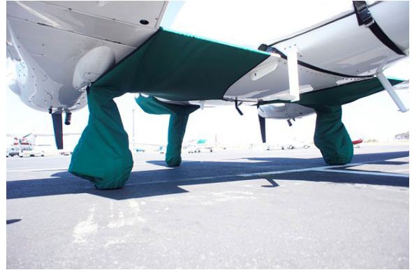
Twinstar Landing Gear &amp; Gearwell Covers