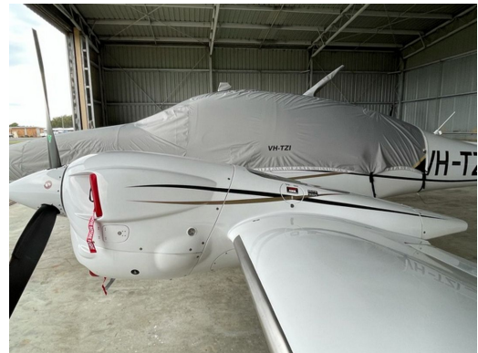
DA-62 Travel Weight Canopy/Nose Cover, Engine Plugs