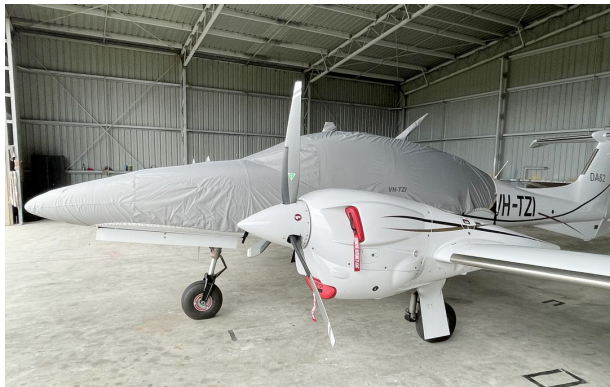
Diamond DA-62 Canopy/Nose Cover, Engine Plugs

Engine Inlet Plugs are custom fit for your Diamond DA-62 intakes, made with heavy-duty vinyl material, and stuffed with a single block of sculpted urethane foam. Each plug has a zipper that allows the foam to be removed and dried if necessary. Engine plugs have warning flags that are visible from the cockpit or 'remove before flight' streamers sewn onto the face of the plugs. Most plugs are imprinted with the aircraft registration number in black for an extra charge. Storage bag NOT included. Engine plugs may be inserted after flight when the engine is still warm. Engine Inlet Plugs are commonly referred to as Cowl Plugs, Intake Plugs, Cowl Blocks, Engine Blocks, and Engine Bungs.