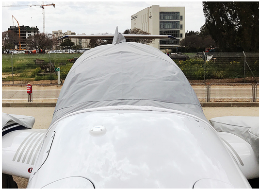
Diamond DA-62 Travel Cover, Light Weight Travel Canopy Cover