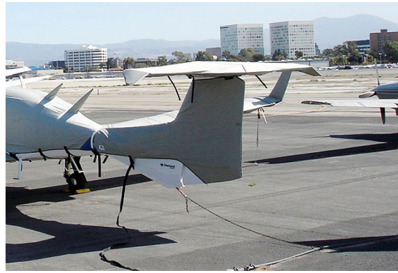
DA-42 Empennage & Horiz. Stab. Covers