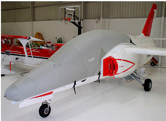
S-211 Canopy/Nose Cover & Engine Plugs

This cover type is made from Silver Acrylic Sunbrella canvas and is 100% lined with a soft and smooth microfiber. Bruce's Custom Covers developed this material combination especially for aircraft protection. The outer material is medium weight and treated for water resistance, UV resistance and anti-static buildup. The inner lining is a very soft and smooth microfiber to prevent scratching. The material is very reflective, and tests show that the cabin interior temperature can be reduced to near-ambient temperature on the hottest of days. It is water, ice and snow repellent, yet breathable to allow moisture to escape from between the cover and the aircraft surface.