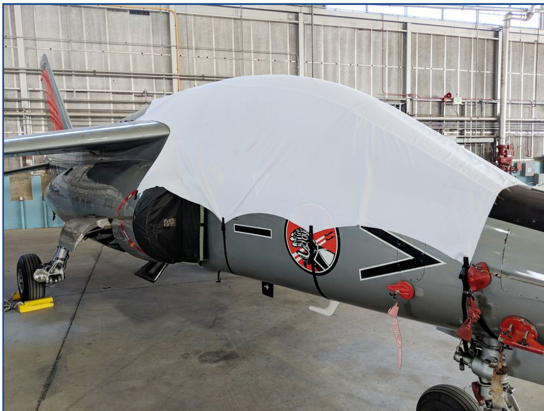
Dornier Alpha Jet Canopy Cover, test fit cover