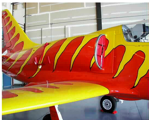
Inlet Plug, folding type