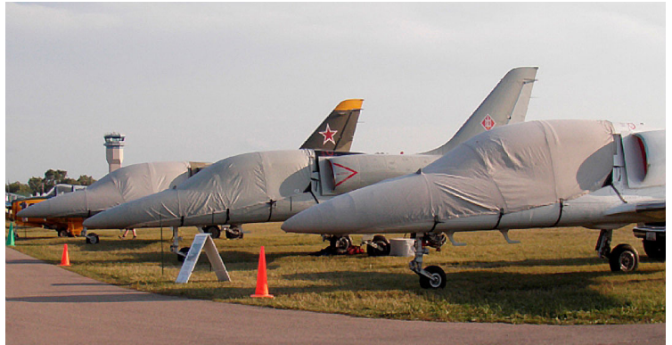
L-39 Canopy/Nose Covers & Plugs