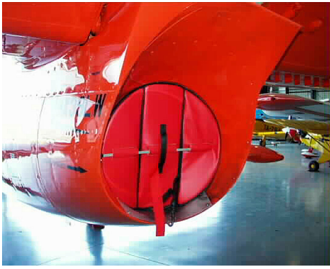
Exhaust Plug, folding type