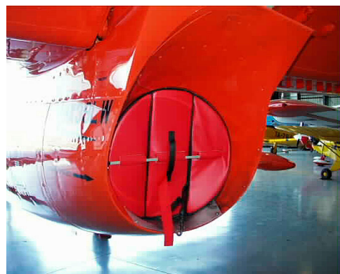
Exhaust Plug, folding type