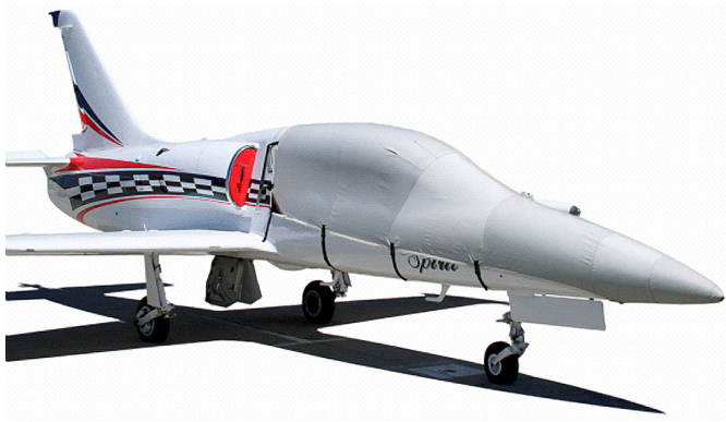
L39 Canopy/Nose Cover & Intake Plugs