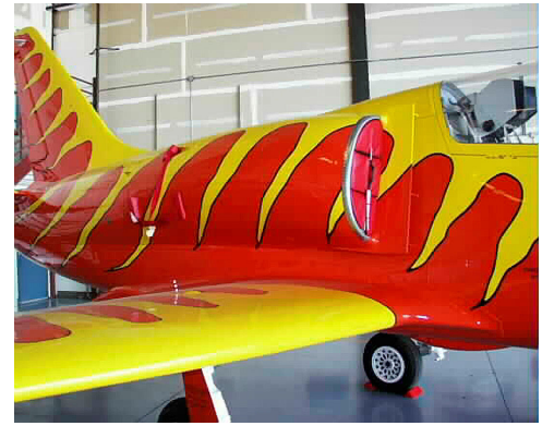
Inlet Plug, folding type