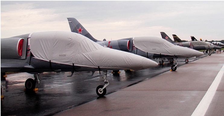
L-39 Canopy/Nose Covers & Plugs