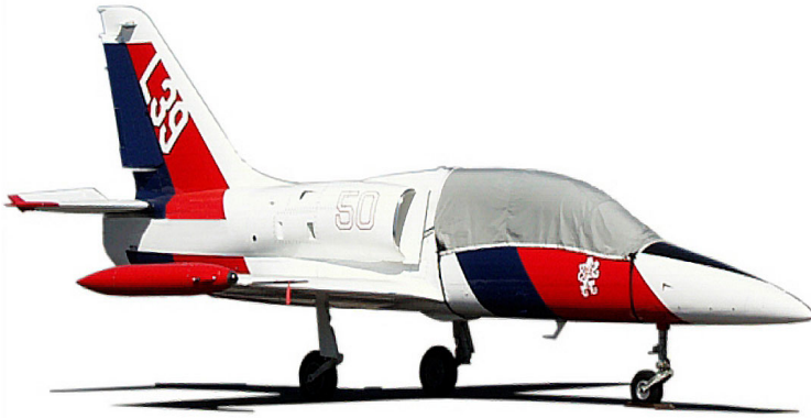
Canopy Cover for Aero L-39 Albatros

This cover type is made from Silver Acrylic Sunbrella canvas and is 100% lined with a soft and smooth microfiber. Bruce's Custom Covers developed this material combination especially for aircraft protection. The outer material is medium weight and treated for water resistance, UV resistance and anti-static buildup. The inner lining is a very soft and smooth microfiber to prevent scratching. The material is very reflective, and tests show that the cabin interior temperature can be reduced to near-ambient temperature on the hottest of days. It is water, ice and snow repellent, yet breathable to allow moisture to escape from between the cover and the aircraft surface.