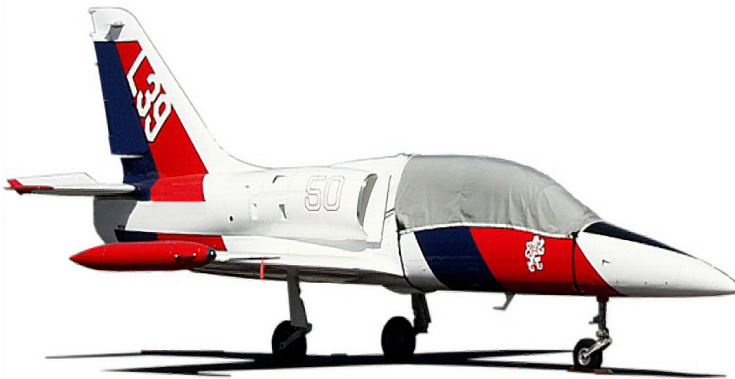
Canopy Cover for Aero L-39 Albatros

Travel Covers are made with Silver Solution-Dyed Polyester fabric and only lined over the windshield to save weight. The material is lightweight and more compact for easy stowage in the aircraft. The polyester material is water resistant, but only intended for occasional use outside. We also have an ultra lightweight material available for fitted hangar dust covers. For daily outdoor use, the non-travel Sunbrella Cover is the best choice.