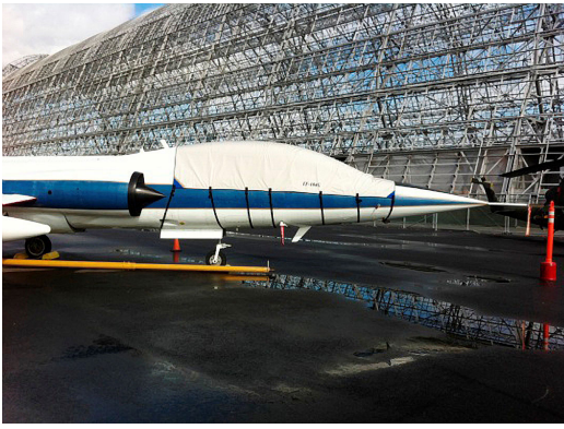
F-104 Tandem Canopy Cover