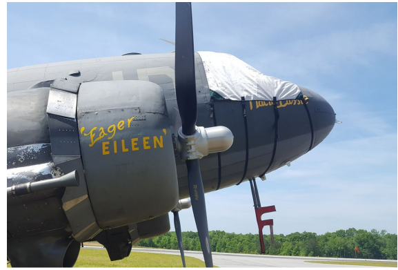
Douglas DC-3 Cockpit Cover