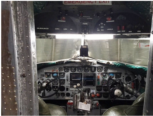
Douglas DC-3 Cockpit Heatshields

Cockpit Heatshields are interior sunshades for the aircraft's cockpit. The product is a unique composite of closed-cell foam with a silver mylar finish. The semi-rigid design is stiff enough to stand inside the window framing. The set folds up flat and is easily stored in the included storage sleeve. Some designs may require velcro and suction cups. A Heatshield is an excellent short-term remedy for cockpit overheating, but an external fabric cover is more effective for long-term protection.