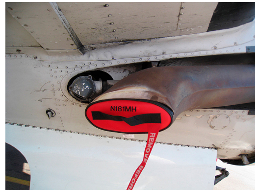
Beech 18 Exhaust Plugs