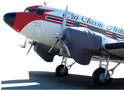
Engine Covers are available in either standard or insulated designs.