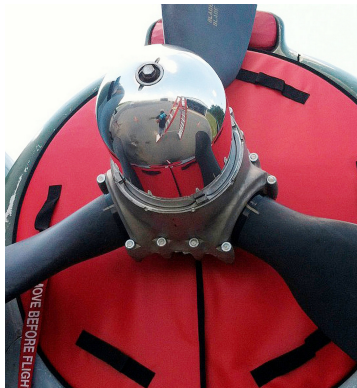
C-46 Radial Engine Intake Plug

Engine Inlet Plugs are custom fit for your Douglas DC-3 intakes, made with heavy-duty vinyl material, and stuffed with a single block of sculpted urethane foam. Each plug has a zipper that allows the foam to be removed and dried if necessary. Engine plugs have warning flags that are visible from the cockpit or 'remove before flight' streamers sewn onto the face of the plugs. Most plugs are imprinted with the aircraft registration number in black for an extra charge. Storage bag NOT included. Engine plugs may be inserted after flight when the engine is still warm. Engine Inlet Plugs are commonly referred to as Cowl Plugs, Intake Plugs, Cowl Blocks, Engine Blocks, and Engine Bungs.