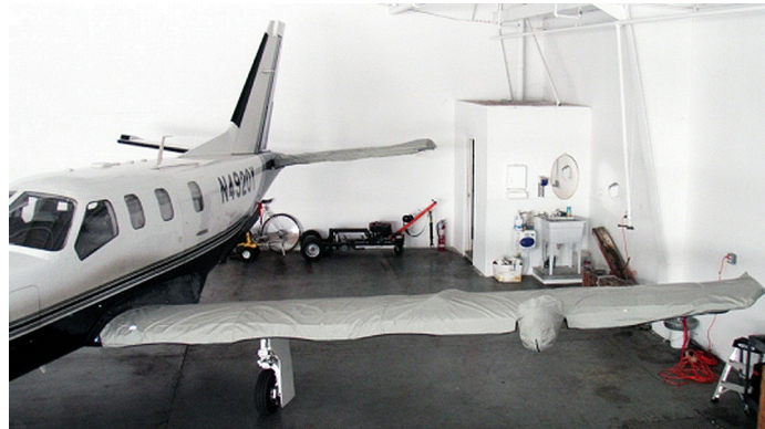
Pilatus PC-12 Wing Covers

WINTER USE MATERIAL - Made with Solution-Dyed Polyester fabric, this option is intended for seasonal use to aid in deicing, rain mitigation, or for occasional travel. The material is lighter and more compact, but more susceptible to UV damage and may have a shorter useful life if used continuously outside than the all-year use material.