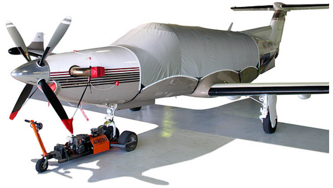
PC-12 Canopy Cover, Engine Plugs, Prop Tie/Exhaust Covers