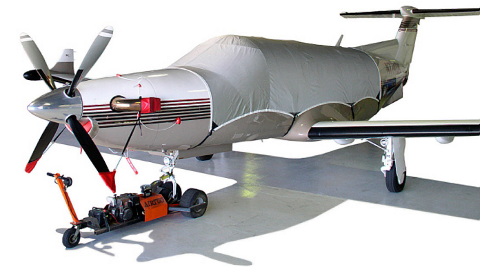
PC-12 Canopy Cover, Engine Plugs, Prop Tie/Exhaust Covers

Engine Inlet Plugs are custom fit for your Beech Denali 220 intakes, made with heavy-duty vinyl material, and stuffed with a single block of sculpted urethane foam. Each plug has a zipper that allows the foam to be removed and dried if necessary. Engine plugs have warning flags that are visible from the cockpit or 'remove before flight' streamers sewn onto the face of the plugs. Most plugs are imprinted with the aircraft registration number in black for an extra charge. Storage bag NOT included. Engine plugs may be inserted after flight when the engine is still warm. Engine Inlet Plugs are commonly referred to as Cowl Plugs, Intake Plugs, Cowl Blocks, Engine Blocks, and Engine Bungs.