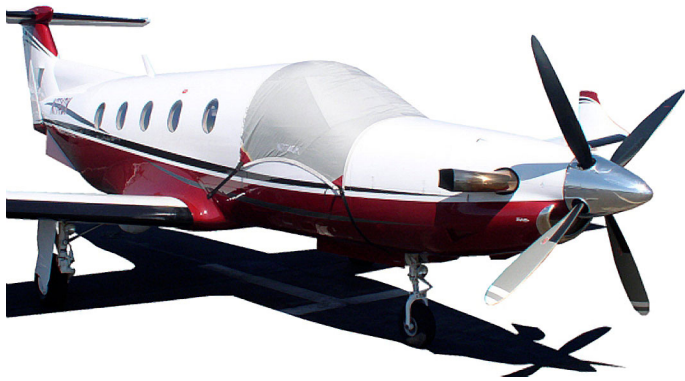
PC-12 Windshield Cover

This cover type is made from Silver Acrylic Sunbrella canvas and is 100% lined with a soft and smooth microfiber. Bruce's Custom Covers developed this material combination especially for aircraft protection. The outer material is medium weight and treated for water resistance, UV resistance and anti-static buildup. The inner lining is a very soft and smooth microfiber to prevent scratching. The material is very reflective, and tests show that the cabin interior temperature can be reduced to near-ambient temperature on the hottest of days. It is water, ice and snow repellent, yet breathable to allow moisture to escape from between the cover and the aircraft surface.