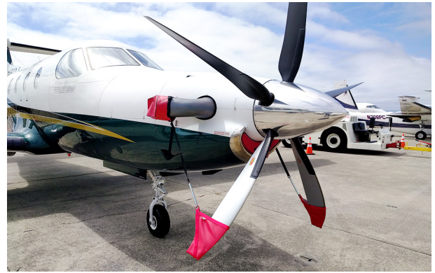
Main Intake Plug and Prop-Tie/Exhaust Covers. (Sold Separately)