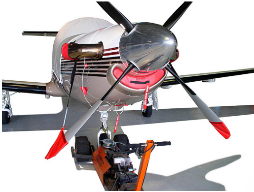
Pilatus PC-12 LARGE ENGINE INLET PLUG, SMALL PLUGS SET, Prop Tie/Exhaust Covers

Engine Inlet Plugs are custom fit for your Beech Denali 220 intakes, made with heavy-duty vinyl material, and stuffed with a single block of sculpted urethane foam. Each plug has a zipper that allows the foam to be removed and dried if necessary. Engine plugs have warning flags that are visible from the cockpit or 'remove before flight' streamers sewn onto the face of the plugs. Most plugs are imprinted with the aircraft registration number in black for an extra charge. Storage bag NOT included. Engine plugs may be inserted after flight when the engine is still warm. Engine Inlet Plugs are commonly referred to as Cowl Plugs, Intake Plugs, Cowl Blocks, Engine Blocks, and Engine Bungs.