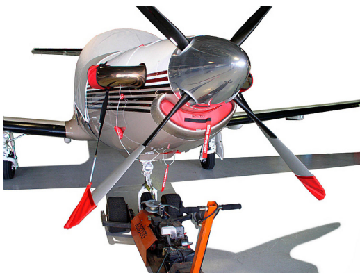
Pilatus PC-12 LARGE ENGINE INLET PLUG, SMALL PLUGS SET, Prop Tie/Exhaust Covers

This cover type is made from Silver Acrylic Sunbrella canvas and is 100% lined with a soft and smooth microfiber. Bruce's Custom Covers developed this material combination especially for aircraft protection. The outer material is medium weight and treated for water resistance, UV resistance and anti-static buildup. The inner lining is a very soft and smooth microfiber to prevent scratching. The material is very reflective, and tests show that the cabin interior temperature can be reduced to near-ambient temperature on the hottest of days. It is water, ice and snow repellent, yet breathable to allow moisture to escape from between the cover and the aircraft surface.