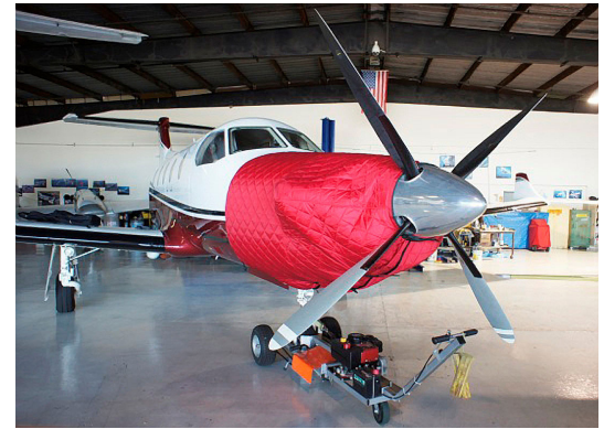
Pilatus PC-12 Insulated Engine Cover