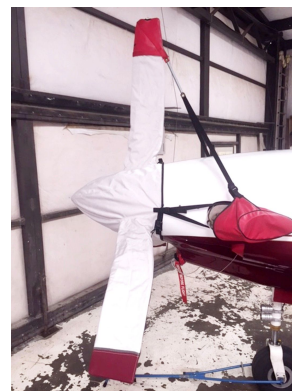
Pilatus PC-12 Prop Cover, Prop Tie/Exhaust Cover