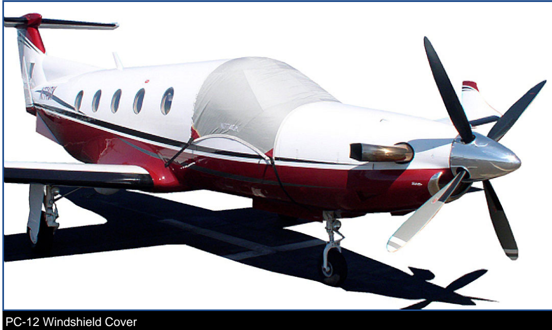
PC-12 Windshield Cover