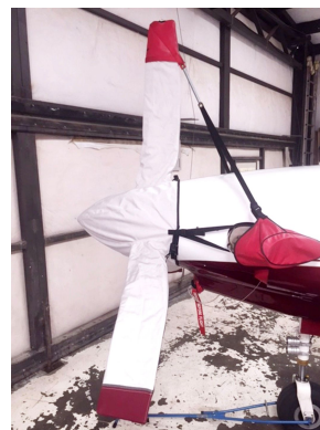
Pilatus PC-12 Prop Cover, Prop Tie/Exhaust Cover