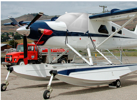
Turbo Beaver Cockpit Cover, Prop Tie/Exhaust Covers, Engine Plug