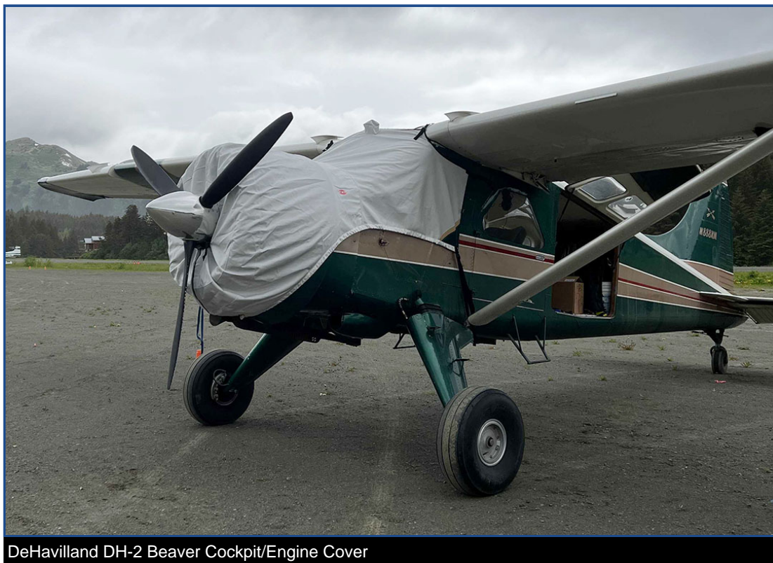
DeHavilland DH-2 Beaver Cockpit/Engine Cover