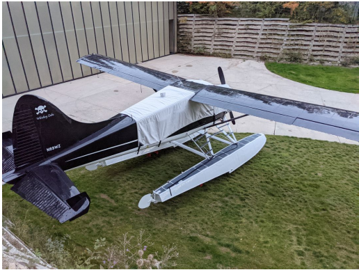
Beaver DHC2 MK1 Canopy/Engine Cover

This cover type is made from Silver Acrylic Sunbrella canvas and is 100% lined with a soft and smooth microfiber. Bruce's Custom Covers developed this material combination especially for aircraft protection. The outer material is medium weight and treated for water resistance, UV resistance and anti-static buildup. The inner lining is a very soft and smooth microfiber to prevent scratching. The material is very reflective, and tests show that the cabin interior temperature can be reduced to near-ambient temperature on the hottest of days. It is water, ice and snow repellent, yet breathable to allow moisture to escape from between the cover and the aircraft surface.