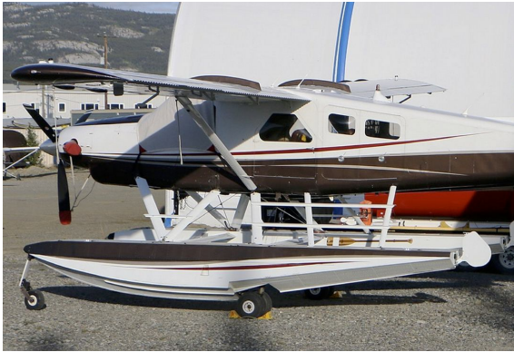
DeHavilland Turbo Beaver Cockpit Covers