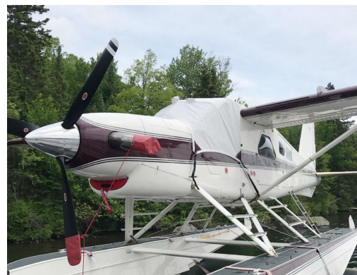
DeHavilland Turbo Beaver Cockpit Cover and Inlet Plug