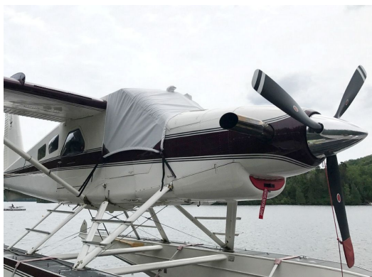
DeHavilland Turbo Beaver Cockpit Cover and Inlet Plug

Engine Inlet Plugs are custom fit for your DeHavilland Beaver DHC-2, U-6A, U-6B intakes, made with heavy-duty vinyl material, and stuffed with a single block of sculpted urethane foam. Each plug has a zipper that allows the foam to be removed and dried if necessary. Engine plugs have warning flags that are visible from the cockpit or 'remove before flight' streamers sewn onto the face of the plugs. Most plugs are imprinted with the aircraft registration number in black for an extra charge. Storage bag NOT included. Engine plugs may be inserted after flight when the engine is still warm. Engine Inlet Plugs are commonly referred to as Cowl Plugs, Intake Plugs, Cowl Blocks, Engine Blocks, and Engine Bungs.