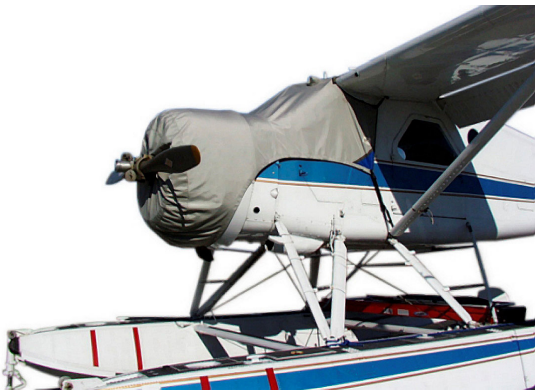
Beaver Windshield/Engine Cover

This cover type is made from Silver Acrylic Sunbrella canvas and is 100% lined with a soft and smooth microfiber. Bruce's Custom Covers developed this material combination especially for aircraft protection. The outer material is medium weight and treated for water resistance, UV resistance and anti-static buildup. The inner lining is a very soft and smooth microfiber to prevent scratching. The material is very reflective, and tests show that the cabin interior temperature can be reduced to near-ambient temperature on the hottest of days. It is water, ice and snow repellent, yet breathable to allow moisture to escape from between the cover and the aircraft surface.