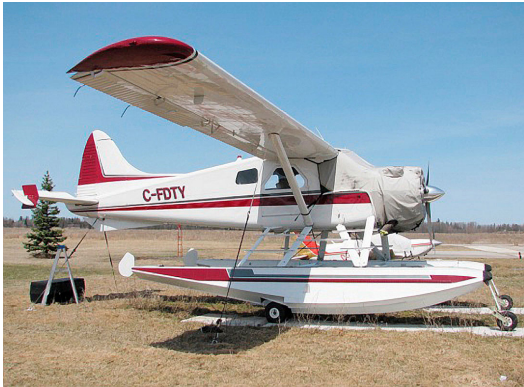
Beaver Windshield/Engine Cover

Travel Covers are made with Silver Solution-Dyed Polyester fabric and only lined over the windshield to save weight. The material is lightweight and more compact for easy stowage in the aircraft. The polyester material is water resistant, but only intended for occasional use outside. We also have an ultra lightweight material available for fitted hangar dust covers. For daily outdoor use, the non-travel Sunbrella Cover is the best choice.