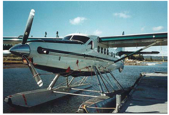
Covers & Plugs for the Turbine Otter