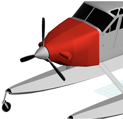
Turbo Beaver Insulated Engine Cover, 3D model

The material is very reflective, and tests show that the cabin interior temperature can be reduced to near-ambient temperature on the hottest of days. It is water, ice and snow repellent, yet breathable to allow moisture to escape from between the cover and the aircraft surface.