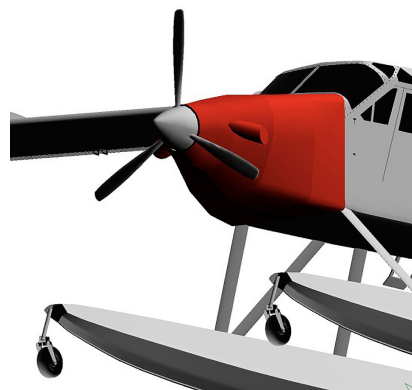
Turbo Beaver Insulated Engine Cover, 3D model