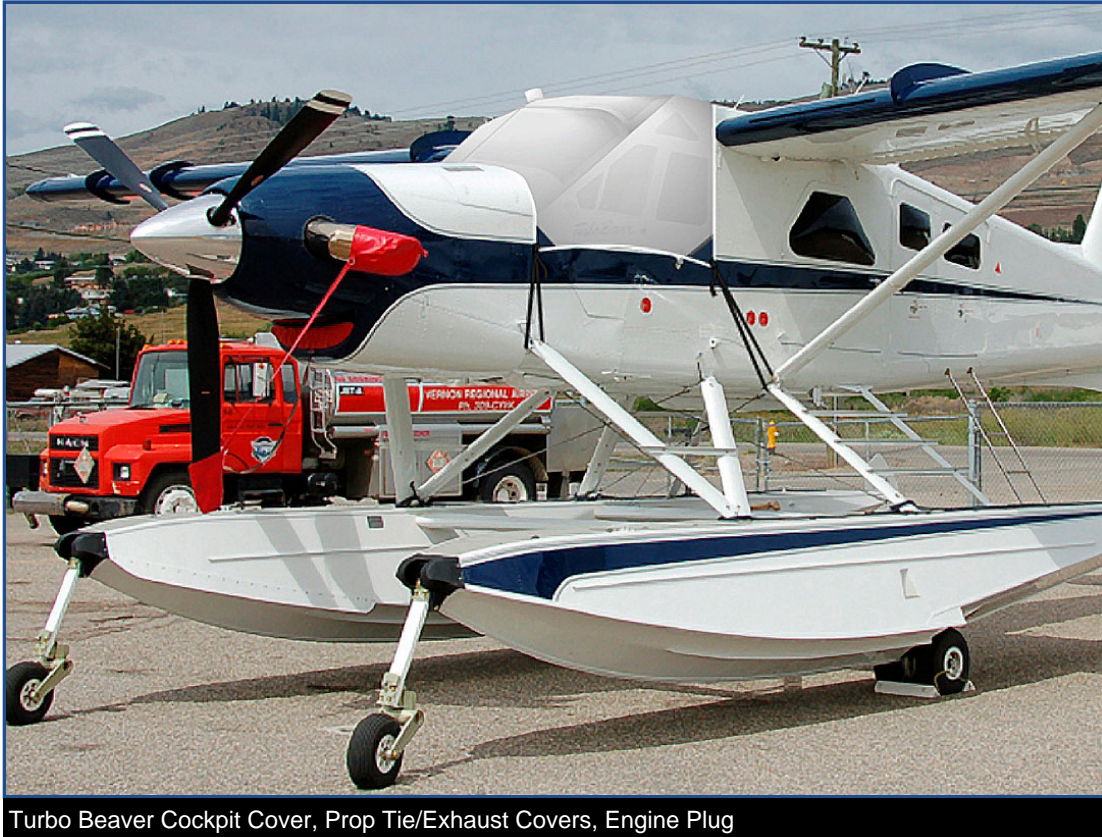
Turbo Beaver Cockpit Cover, Prop Tie/Exhaust Covers, Engine Plug