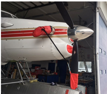
DeHavilland Turbin Otter Intake plugs, Prop Tie/Exhaust Covers

The material is very reflective, and tests show that the cabin interior temperature can be reduced to near-ambient temperature on the hottest of days. It is water, ice and snow repellent, yet breathable to allow moisture to escape from between the cover and the aircraft surface.