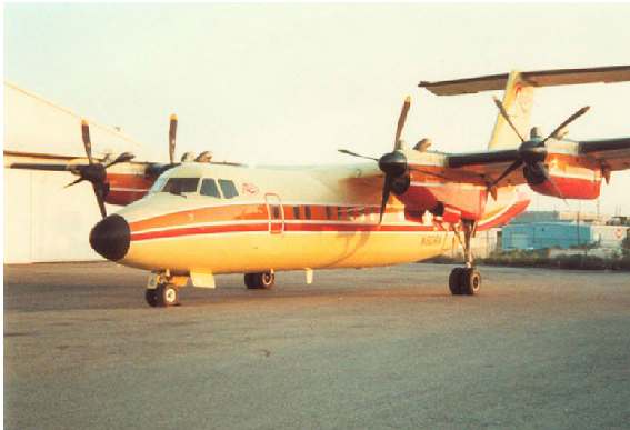
Covers & Plugs for the Dash 7

This cover type is made from Silver Acrylic Sunbrella canvas and is 100% lined with a soft and smooth microfiber. Bruce's Custom Covers developed this material combination especially for aircraft protection. The outer material is medium weight and treated for water resistance, UV resistance and anti-static buildup. The inner lining is a very soft and smooth microfiber to prevent scratching. The material is very reflective, and tests show that the cabin interior temperature can be reduced to near-ambient temperature on the hottest of days. It is water, ice and snow repellent, yet breathable to allow moisture to escape from between the cover and the aircraft surface.