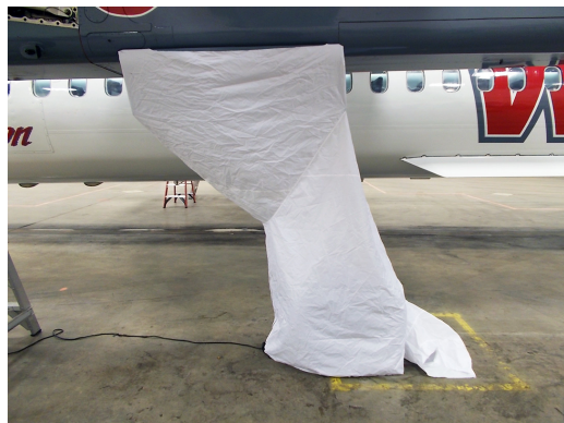
Q400, Main gear landing/tire covers - Cold Weather Ops

ALL-YEAR USE MATERIAL - Made with Silver Acrylic Sunbrella canvas, the all-year use material is the best option for sun protection and cover longevity. This heavier more durable material is intended for all weather conditions, such as rain and snow or lots of sun.