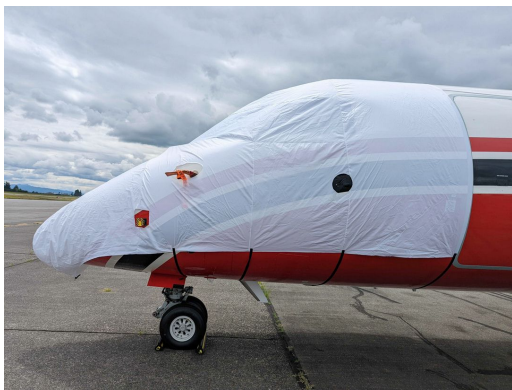
DeHavilland Dash 8, Q400 Cockpit/Nose Cover, test fit cover