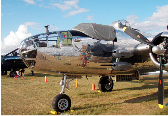
Mitchell B25 Cockpit Cover (Snap-On Type)

This cover type is made from Silver Acrylic Sunbrella canvas and is 100% lined with a soft and smooth microfiber. Bruce's Custom Covers developed this material combination especially for aircraft protection. The outer material is medium weight and treated for water resistance, UV resistance and anti-static buildup. The inner lining is a very soft and smooth microfiber to prevent scratching. The material is very reflective, and tests show that the cabin interior temperature can be reduced to near-ambient temperature on the hottest of days. It is water, ice and snow repellent, yet breathable to allow moisture to escape from between the cover and the aircraft surface.