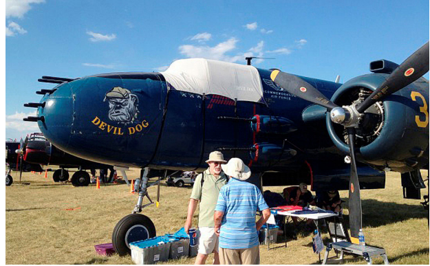
Mitchell B25 Cockpit Cover w/ Custom Imprint (Bellystrap Type)