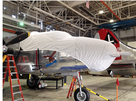
B25 Cockpit/Nose Cover