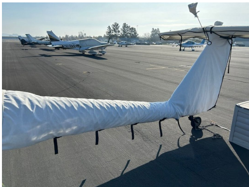
Dimona HK-36 Empennage Cover Set

WINTER USE MATERIAL - Made with Solution-Dyed Polyester fabric, this option is intended for seasonal use to aid in deicing, rain mitigation, or for occasional travel. The material is lighter and more compact, but more susceptible to UV damage and may have a shorter useful life if used continuously outside than the all-year use material.