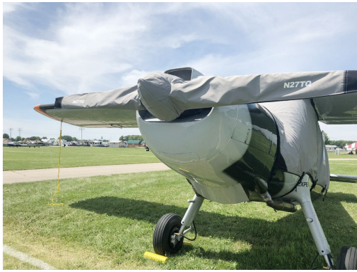
Dornier DO-27 Canopy Cover, Prop Cover