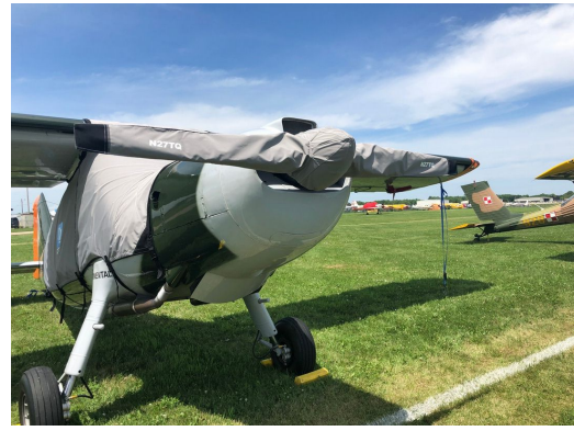
Dornier DO-27 Canopy Cover, Prop Cover