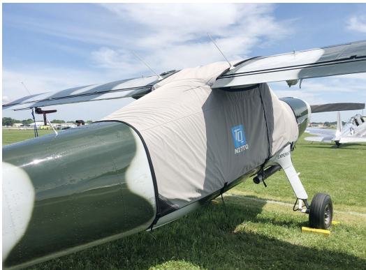
Dornier DO-27 Canopy Cover

This cover type is made from Silver Acrylic Sunbrella canvas and is 100% lined with a soft and smooth microfiber. Bruce's Custom Covers developed this material combination especially for aircraft protection. The outer material is medium weight and treated for water resistance, UV resistance and anti-static buildup. The inner lining is a very soft and smooth microfiber to prevent scratching. The material is very reflective, and tests show that the cabin interior temperature can be reduced to near-ambient temperature on the hottest of days. It is water, ice and snow repellent, yet breathable to allow moisture to escape from between the cover and the aircraft surface.