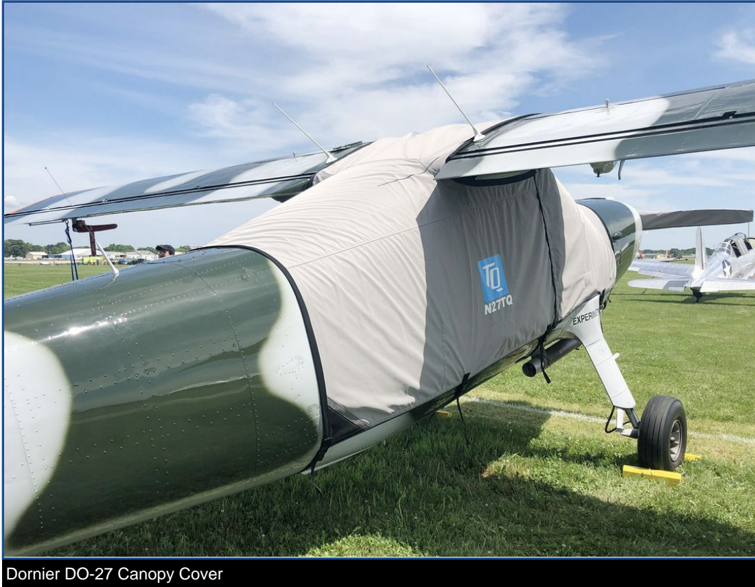
Dornier DO-27 Canopy Cover