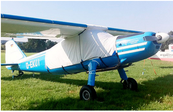
Dornier Do27 Canopy Cover, over-top type