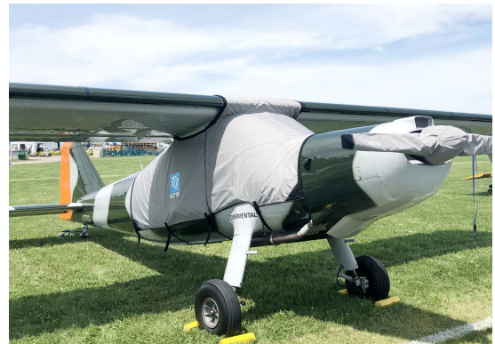
Dornier DO-27 Canopy Cover, Prop Cover