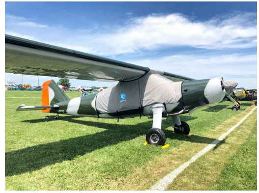
Dornier DO-27 Canopy Cover, Prop Cover