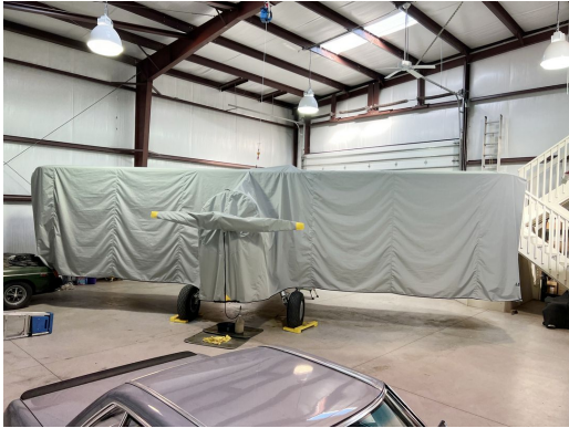
Stearman PT-13 Full Body Dust Cover

Some high value aircraft end up logging lots of hangar time, and become dust magnets in the process. A high quality, well fitting dust cover provides easy assurance that the aircraft's surfaces remain clean and free of grit and grime. Available in a large variety of colors, each dust cover is custom made according to aircraft details and customer preferences. Fire retardant fabrics are also available.