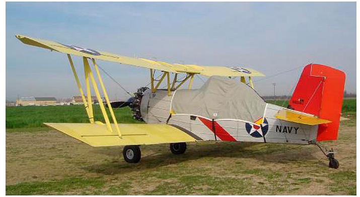
Grumman Ag Cat Canopy Cover