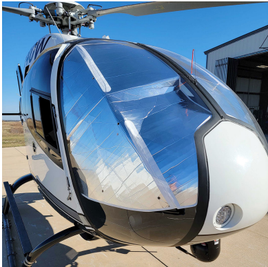
Eurocopter EC-120 Windshield HeatShields

Heatshields are interior sunshades for an aircraft's windows or canopy glass. The product is a unique composite of closed-cell foam with a silver mylar finish. The semi-rigid design is stiff enough to stand along the inside of the windshield using sun visors or window framing. It folds up flat and easily stores in the included storage sleeve. Some designs may require velcro and suction cups. A Heatshield is an excellent short-term remedy for cockpit overheating.