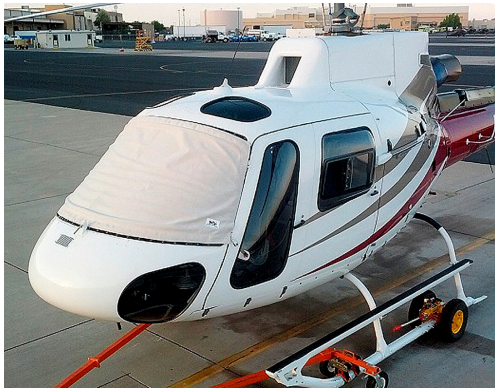
AS350 Windshield Cover, pinches in door jambs