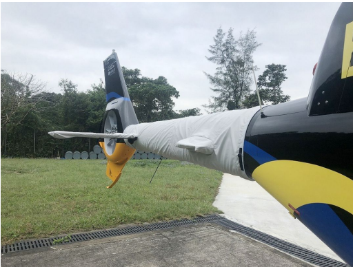
Eurocopter EC-120B Tailboom Cover

The Tailboom Cover details vary by model, but generally the helicopter tail boom cover encloses the tail boom from the "bottleneck" to the aft end. They usually also cover the horizontal stabilizers, and are custom made to allow for antennae, lights, and other protrusions. They attach with straps underneath the tail boom. Covers for the vertical and horizontal stabilizers are also available separately. Specific information for each model is available on request.