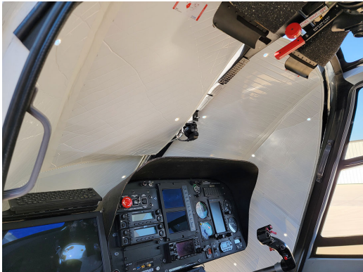
Eurocopter EC-120 Windshield HeatShields