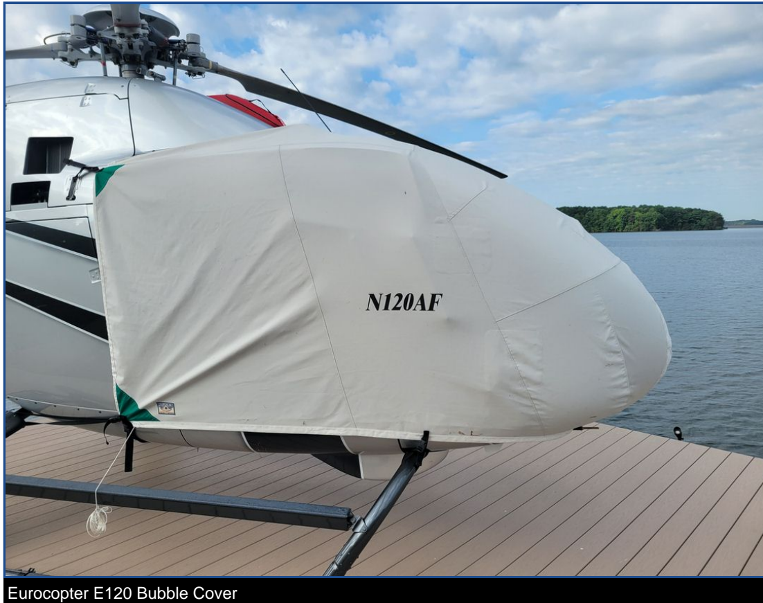
Eurocopter E120 Bubble Cover