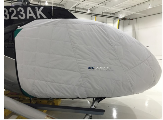
EC-130 Insulated Bubble Cover