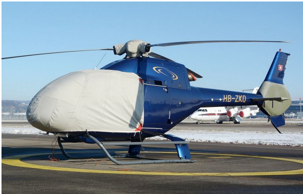
Eurocopter EC-120 Bubble, Rotor Mast & Tailfan Covers

Insulated Covers Material - A special composite material of solution-dyed polyester, 3M Thinsulate insulation, and soft nylon interior fabric. Our insulated covers are designed to complement an engine preheater and help retain heat in the engine compartment after shutdown. If you operate your aircraft in cold-weather, these covers will help prevent engine wear and tear.