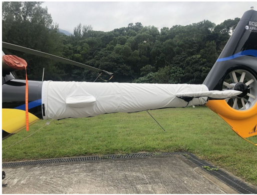
Eurocopter EC-120B Tailboom Cover

The Tailboom Cover details vary by model, but generally the helicopter tail boom cover encloses the tail boom from the "bottleneck" to the aft end. They usually also cover the horizontal stabilizers, and are custom made to allow for antennae, lights, and other protrusions. They attach with straps underneath the tail boom. Covers for the vertical and horizontal stabilizers are also available separately. Specific information for each model is available on request.