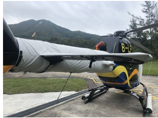
Eurocopter EC-120B Tailboom Cover