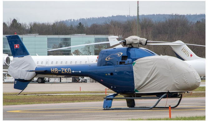
Eurocopter EC-120 Bubble, Rotor Mast & Tailfan Covers