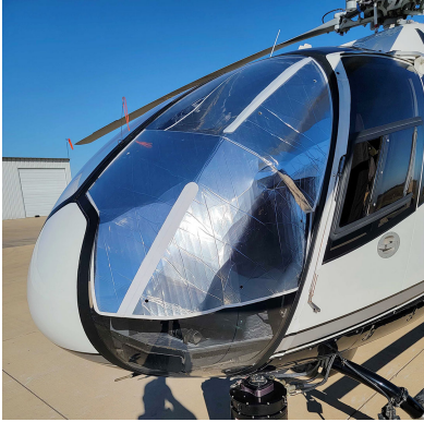
Eurocopter EC-120 Windshield HeatShields

Heatshields are interior sunshades for an aircraft's windows or canopy glass. The product is a unique composite of closed-cell foam with a silver mylar finish. The semi-rigid design is stiff enough to stand along the inside of the windshield using sun visors or window framing. It folds up flat and easily stores in the included storage sleeve. Some designs may require velcro and suction cups. A Heatshield is an excellent short-term remedy for cockpit overheating.