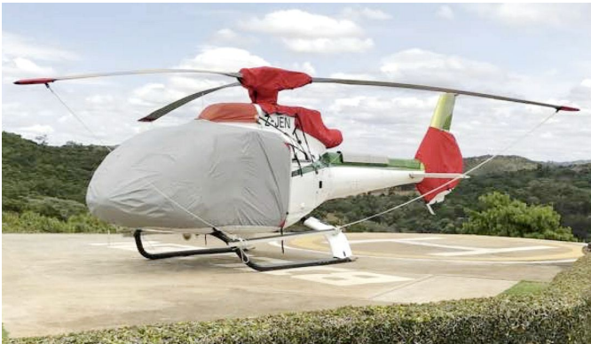
EC130 Bubble, Intake, Exhaust, Rotor Hub & Tailfan Covers