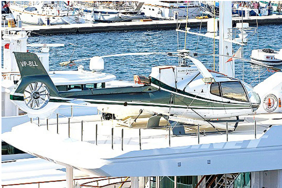
EC-130 Front, Side and Skylight Window HeatShields

Heatshields are interior sunshades for an aircraft's windows or canopy glass. The product is a unique composite of closed-cell foam with a silver mylar finish. The semi-rigid design is stiff enough to stand along the inside of the windshield using sun visors or window framing. It folds up flat and easily stores in the included storage sleeve. Some designs may require velcro and suction cups. A Heatshield is an excellent short-term remedy for cockpit overheating.