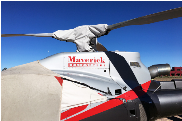
Eurocopter EC-130 Main Rotor Hub Cover

circulation and drainage in freezing weather. Some part numbers have features for an extra charge.