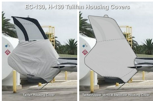
Airbus Helicopter H-130 Tailfan Housing Covers

The Tailboom Cover details vary by model, but generally the helicopter tail boom cover encloses the tail boom from the "bottleneck" to the aft end. They usually also cover the horizontal stabilizers, and are custom made to allow for antennae, lights, and other protrusions. They attach with straps underneath the tail boom. Covers for the vertical and horizontal stabilizers are also available separately. Specific information for each model is available on request.