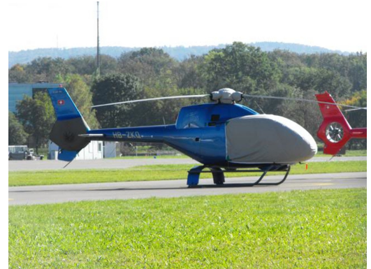
EC-130 Bubble, Tailfan, and Rotor Hub Cover