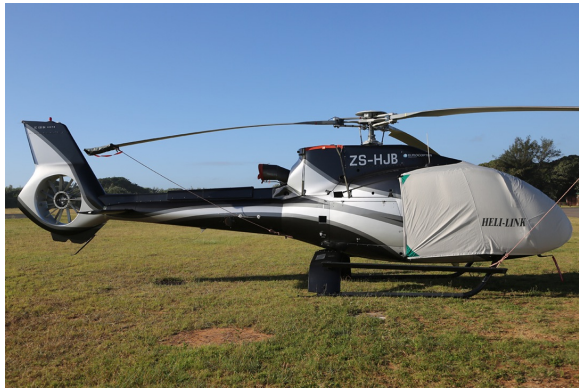
EC-130 Bubble Cover

This cover type is made from Silver Acrylic Sunbrella canvas and is 100% lined with a soft and smooth microfiber. Bruce's Custom Covers developed this material combination especially for aircraft protection. The outer material is medium weight and treated for water resistance, UV resistance and anti-static buildup. The inner lining is a very soft and smooth microfiber to prevent scratching. The material is very reflective, and tests show that the cabin interior temperature can be reduced to near-ambient temperature on the hottest of days. It is water, ice and snow repellent, yet breathable to allow moisture to escape from between the cover and the aircraft surface.