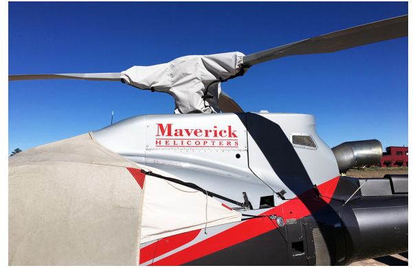
Eurocopter EC-130 Main Rotor Hub Cover