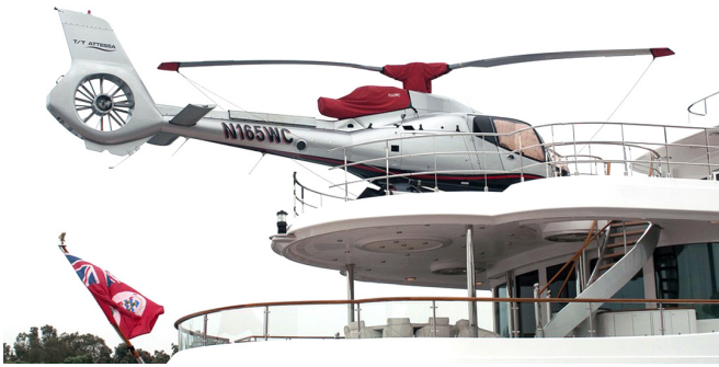
Intake/Exhaust Cover, Rotor Hub Cover (w/ skirt) & Blade Tie Downs

tight at the blade root with straps and quick-release plastic buckles. The Cold Weather Blade Covers are fitted with full-length zippers and optional deice “boots” designed to accept a preheater hose; a small opening at the tip of the cover allows for some air circulation and drainage in freezing weather. Some part numbers have features for an extra charge.