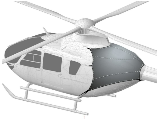
EC135 Exhaust Area Cover, illustration

The Eurocopter EC-135 Intake Cover . Details vary by model, but generally helicopter intake covers are designed to enclose the intake area only. They are smaller than helicopter engine covers, and their attachment details can vary from straps, to snaps, or some combination of the two. Specific information for each model is available on request.