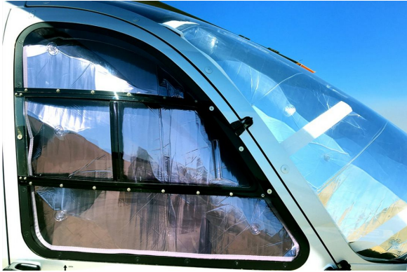
Airbus EC-135 Cockpit HeatShields

Heatshields are interior sunshades for an aircraft's windows or canopy glass. The product is a unique composite of closed-cell foam with a silver mylar finish. The semi-rigid design is stiff enough to stand along the inside of the windshield using sun visors or window framing. It folds up flat and easily stores in the included storage sleeve. Some designs may require velcro and suction cups. A Heatshield is an excellent short-term remedy for cockpit overheating.