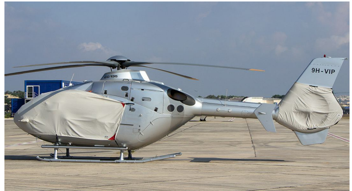
Eurocopter EC-135 Bubble Cover