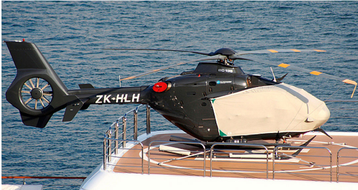
EC-135 Bubble Cover & Exhaust Plugs

This cover type is made from Silver Acrylic Sunbrella canvas and is 100% lined with a soft and smooth microfiber. Bruce's Custom Covers developed this material combination especially for aircraft protection. The outer material is medium weight and treated for water resistance, UV resistance and anti-static buildup. The inner lining is a very soft and smooth microfiber to prevent scratching. The material is very reflective, and tests show that the cabin interior temperature can be reduced to near-ambient temperature on the hottest of days. It is water, ice and snow repellent, yet breathable to allow moisture to escape from between the cover and the aircraft surface.