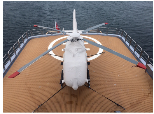
Eurocopter EC-135 Full Body Covers