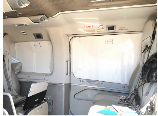
Eurocopter EC-145 Cabin Heatshields