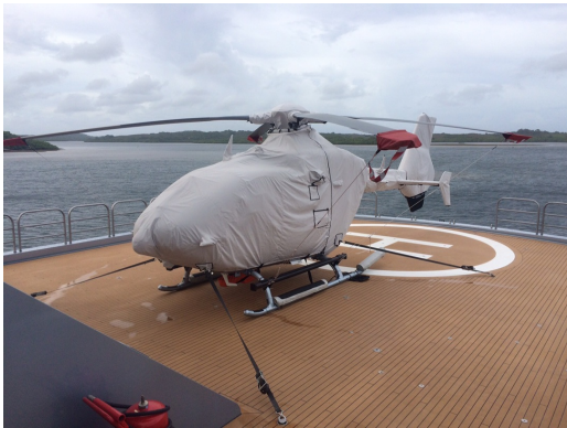
Eurocopter EC-135 Full Body Covers

The Tailboom Cover details vary by model, but generally the helicopter tail boom cover encloses the tail boom from the "bottleneck" to the aft end. They usually also cover the horizontal stabilizers, and are custom made to allow for antennae, lights, and other protrusions. They attach with straps underneath the tail boom. Covers for the vertical and horizontal stabilizers are also available separately. Specific information for each model is available on request.