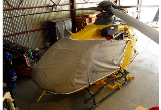
Eurocopter EC-135 Bubble Cover