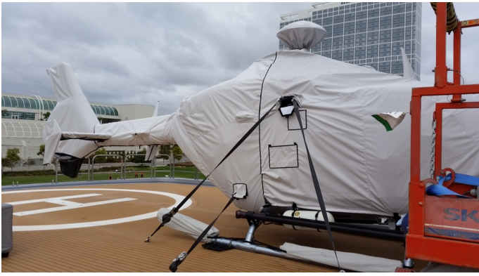
EC-135 Full Cover Set